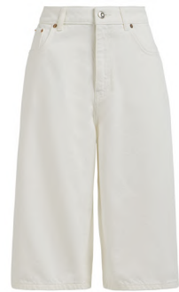
Cream Denim Jorts £18