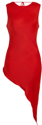
Red Satin Asymmetric Top £20