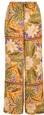
Parrot Palm Print Wide Pull-On Trousers £18