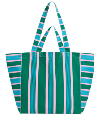
Striped Canvas Shopper £10