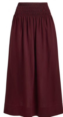
Burgundy Linen Rich Shirred Waist Co-ord Full Skirt £26