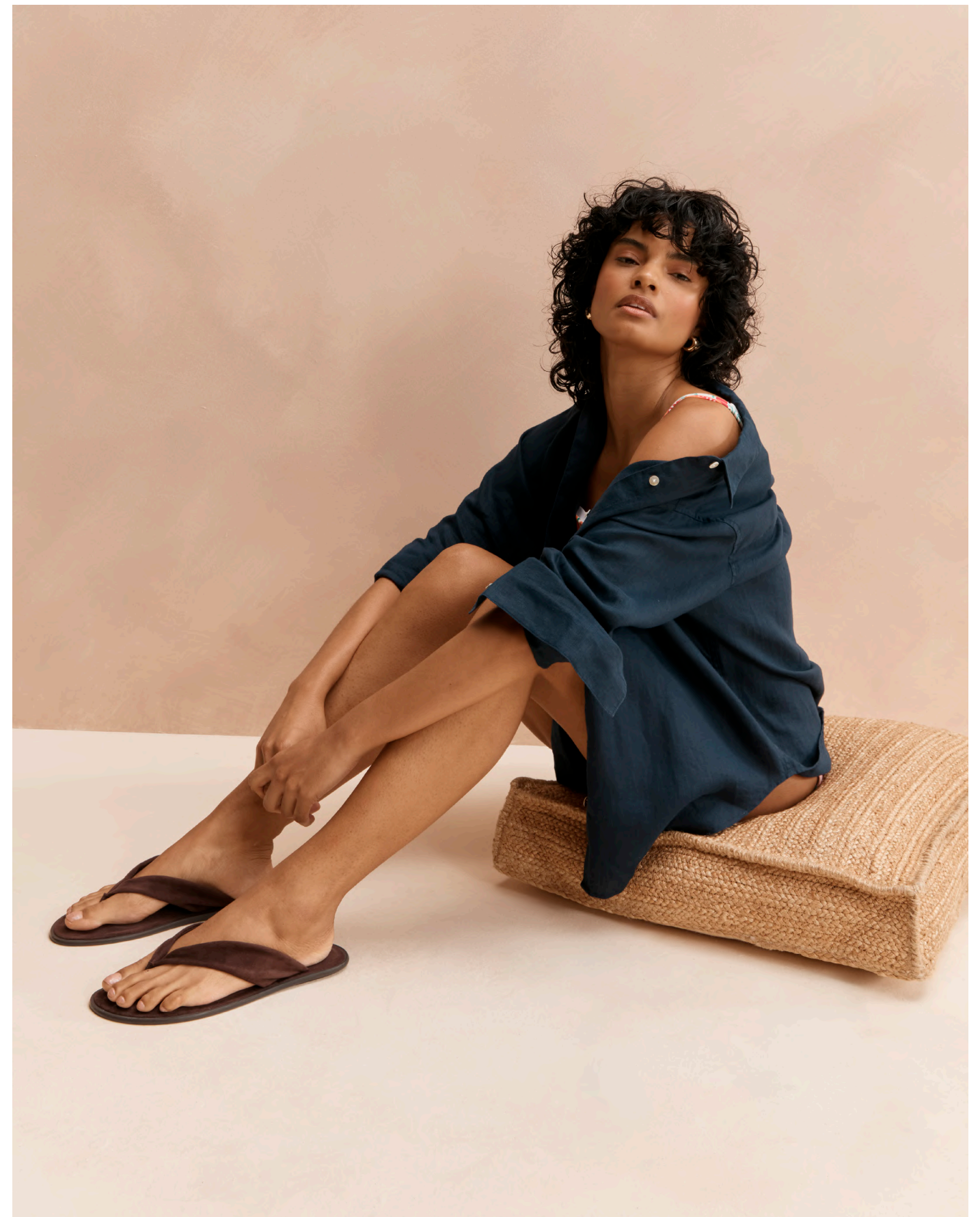
Navy Pure Linen Shirt £26 Pink Postcard Print Square Neck Swimsuit £18 Brown Microfibre Soft Toe Post Sandal £16