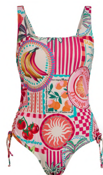
Pink Postcard Print Square Neck Swimsuit £18