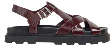
Burgundy Chunky Cleated Sandal £22