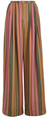
Orange and Green Stripe Wide Leg Trousers £18