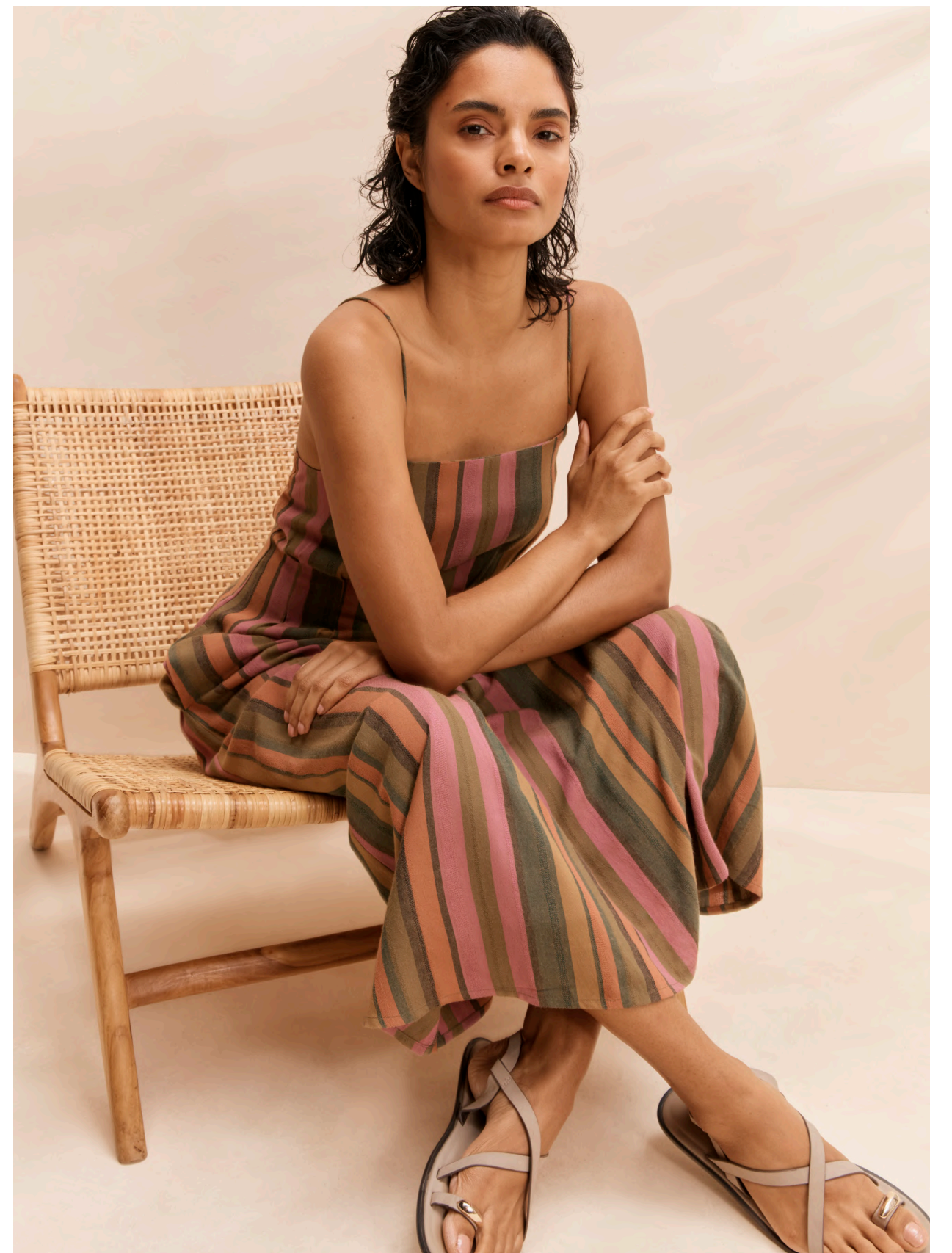
Orange and Green Stripe Midaxi Cami Dress £26 Neutral Toe Ring Strappy Sandal £18