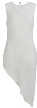
White Satin Asymmetric Top £20