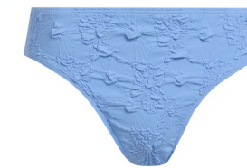
Blue Floral Textured High-Leg Bikini Bottoms £10