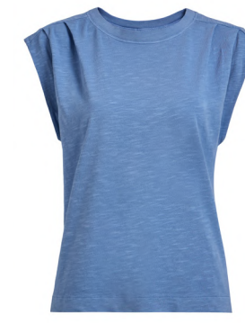
Blue Slub Short Sleeve Tee £8