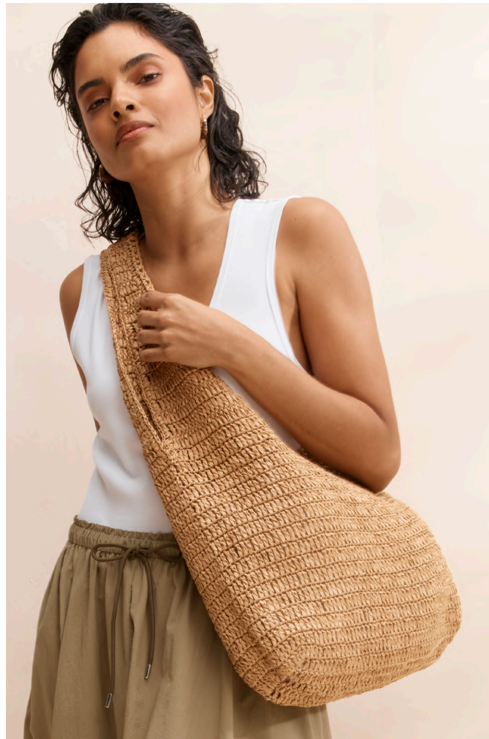
White Button Placket Rib Vest £7 Soft Light Khaki Techno Co-ord Full Skirt £24 Neutral Straw Slouch Shoulder Bag £22 Neutral Suede Panelled Trainer Mule £26