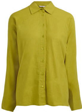
Lime Green Linen Rich Relaxed Shirt £20