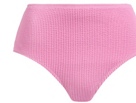
Pink Crinkle Full Brief Bikini Bottoms £12