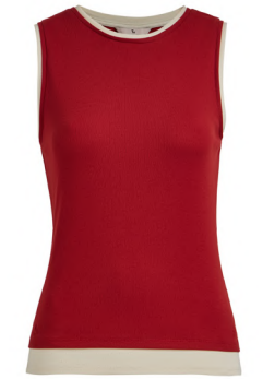
Red Mock Layer Vest £8