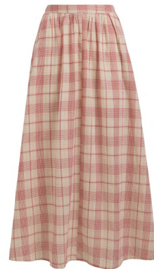
Red Check Full Circle Skirt £22.50