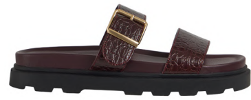
Croc Strap Footbed Sandal with Buckle £22