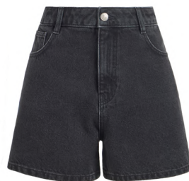
Washed Black Denim A-Line Boy Shorts £14