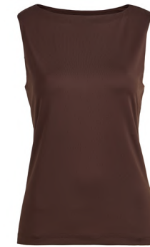
Brown Polyamide Boat Neck Vest £12.50