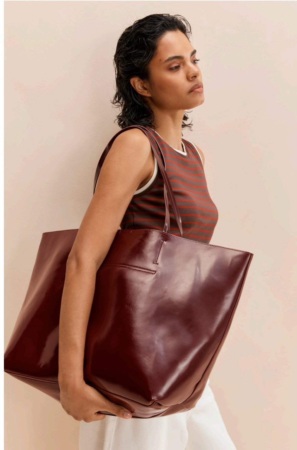
Brown Mock Layer Stripe Vest £8 Cream Denim Jorts £18 Burgundy High Shine Tote Bag £22 Burgundy Toe Ring Strappy Sandal £18