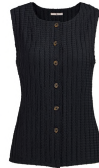
Black Textured Waistcoat Co-ord £14