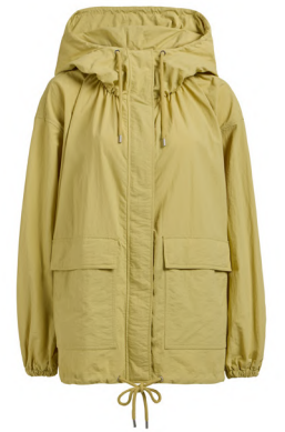
Green Short Windbreaker £34