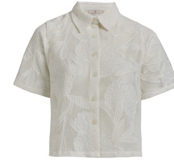
Cream Mesh Embroidered Co-ord Cover-Up Shirt £22