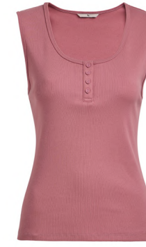
Pink Button Placket Rib Vest £7