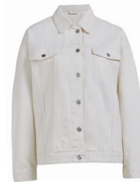
White Oversized Trucker Jacket £28