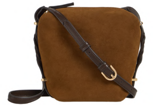
Brown Belt-Handled Core Shopper £16