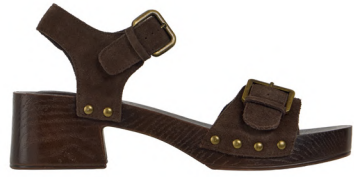
Wood Effect Two-Part Clog £25