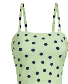
Hybrid Tankini Top £12