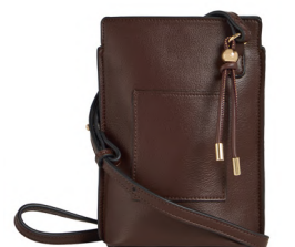
Brown Phone Bag £10