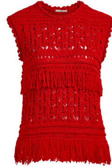
Bright Red Loopy Fringe Tank £22.50