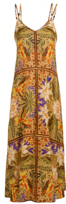
Parrot Palm Print Trapeze Cami Dress £22.50