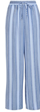
Blue Stripe Wide Leg Trousers £20