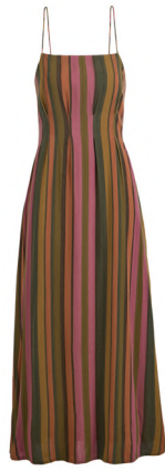
Orange and Green Stripe Midaxi Cami Dress £26