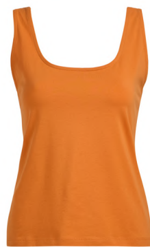
Orange Square Neck Plain Vest £5