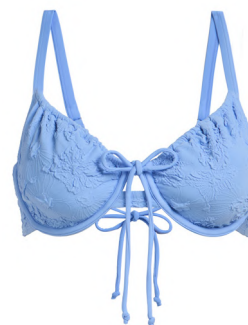
Blue Wired Floral Textured Bikini Top £16