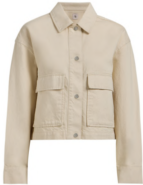
Cream Boxy Twill Jacket £28