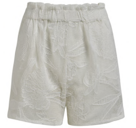
Cream Mesh Embroidered Co-ord Cover-Up Shorts £22