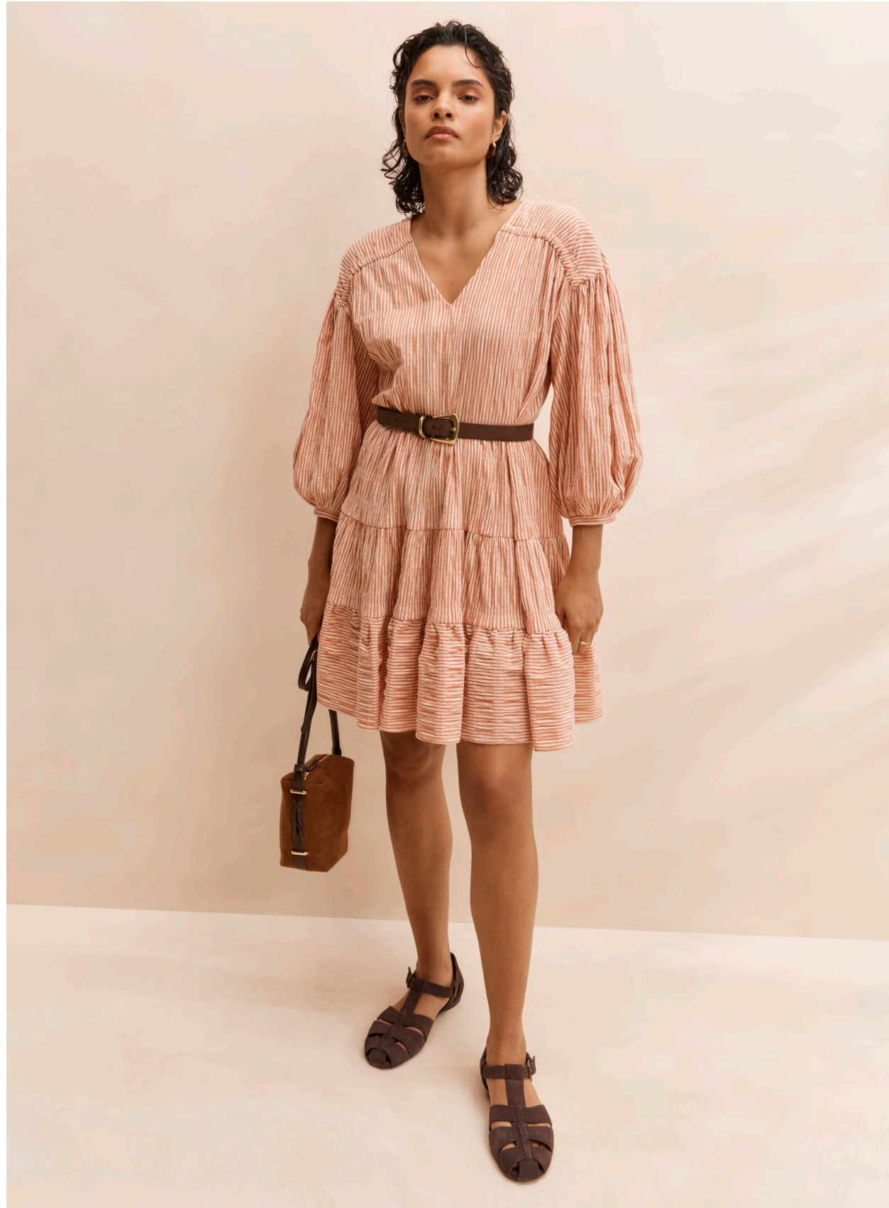
Red Stripe Short Sleeve Mini Dress £24 Brown Belt-Handled Core Shopper £16 Chocolate Suede Fisherman Sandal £24