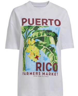
Rio Puerto Rico Graphic Oversized T-Shirt £12.50