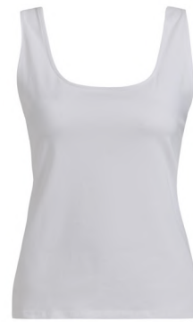
White Square Neck Plain Vest £5