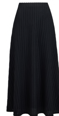
Black Textured Full Skirt Co-ord £14