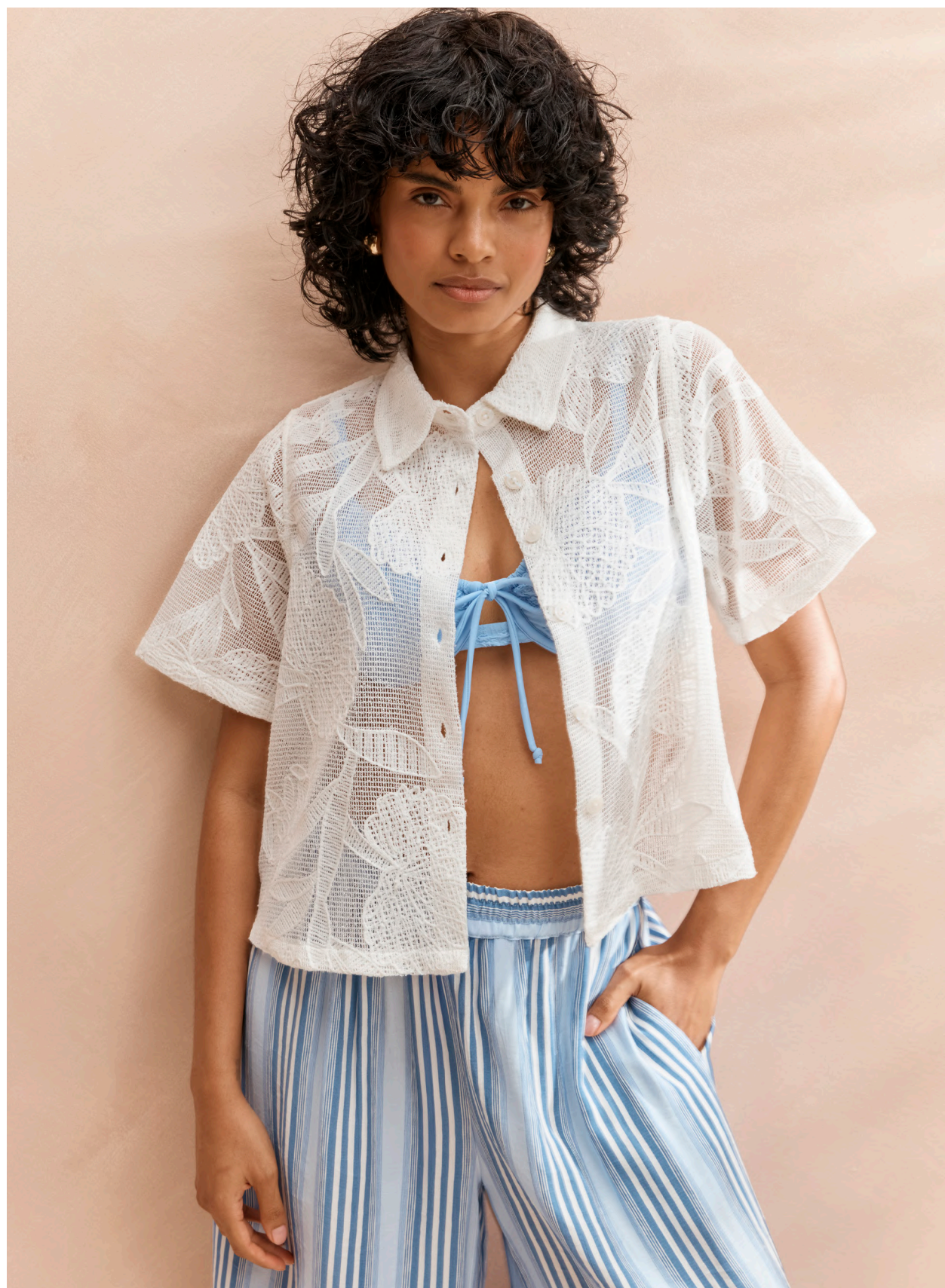
Cream Mesh Embroidered Co-ord Cover-Up Shirt £22 Blue Wired Floral Textured Bikini Top £16 Blue Stripe Wide Leg Trousers £22.50 Cream Woven Mule £20