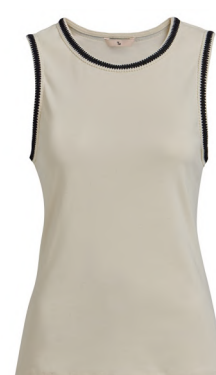
White Crochet Trim Vest £10