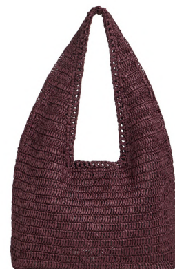
Plum Slouchy Straw Shoulder Bag £18