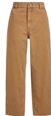
Tan Twisted Seam Barrel Trousers £22.50