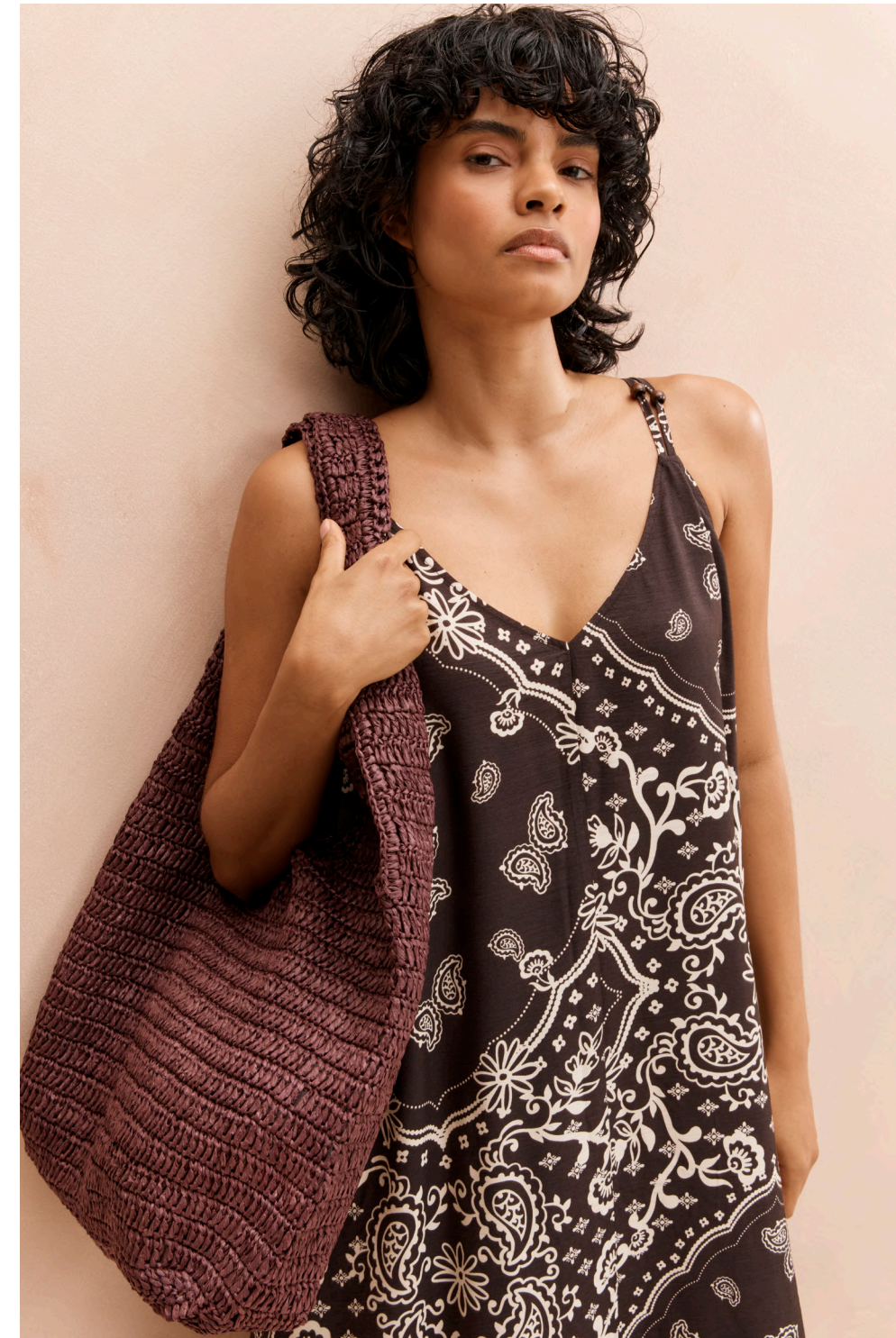
Paisley Print Trapeze Cami Dress £22.50 Plum Slouchy Straw Shoulder Bag £18 Brown Microfibre Soft Toe Post Sandal £16