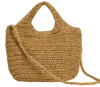
Neutral Mini Straw Handheld Shopper Bag £14