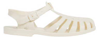
Cream Jelly Fisherman Sandal £9