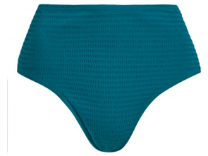
Teal Tankini Full Brief Bottoms £5