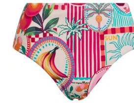
Postcard Print Full Brief Bikini Bottoms £10