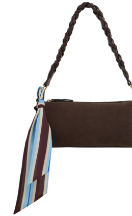
Chocolate Preppy Barrel Bag £16