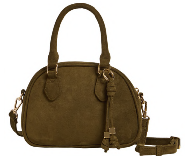
Brown Mini Bowler Cross-Body Bag £18