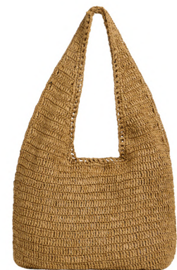
Neutral Straw Slouch Shoulder Bag £22