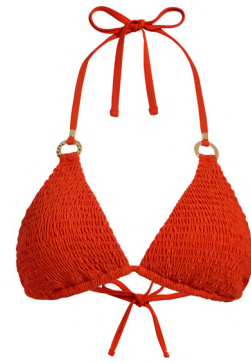
Bright Orange Faux Shirring Triangle Bikini Top £14