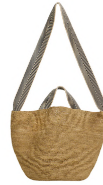
Neutral Handwoven Raffia Bucket Bag £32