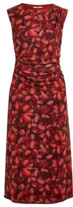
Red Jersey Floral Mesh Dress £22.50