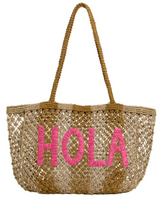
Straw Hola Beach Bag £18