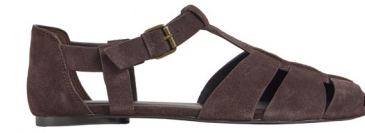
Chocolate Suede Fisherman Sandal £24