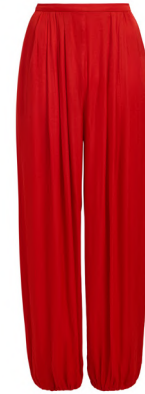
Red Satin Balloon Trousers £24