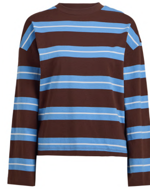
Brown Stripe Long Sleeve Oversized T-Shirt £14