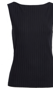
Black Ribbed Boat Neck Top £6