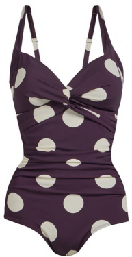
Dark Purple Polka Dot Print Low-Leg Swimsuit £18