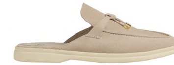
Stone Suede White Sole Loafer Mule £30