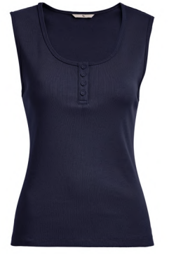
Navy Button Placket Rib Vest £7