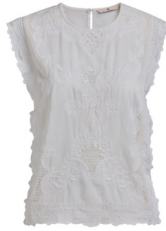
White Lace Embroidered Shell Top £22.50