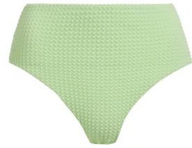
Lime Bubble Texture High Waist Bikini Bottoms £12