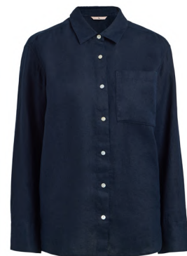
Navy Pure Linen Shirt £26