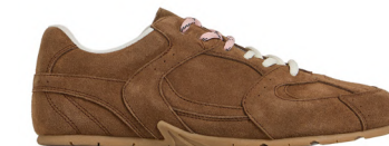
Chocolate Suede Trainer with Contrast Laces £28