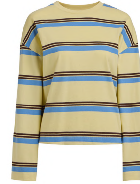
Yellow Stripe Long Sleeve Oversized T-Shirt £14