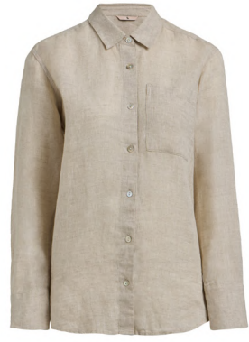
Neutral Pure Linen Shirt £26