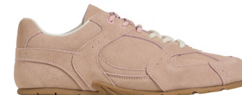
Pink Suede Trainer with Contrast Laces £28