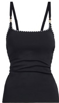
Black Blanket Stitch Tankini Top £16