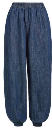
Dark Denim Linen Blend Co-ord Balloon Trousers £25