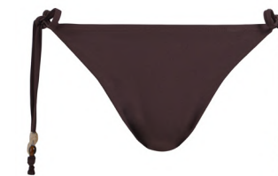
Brown Embroidered Tie Side Bikini Bottoms £10