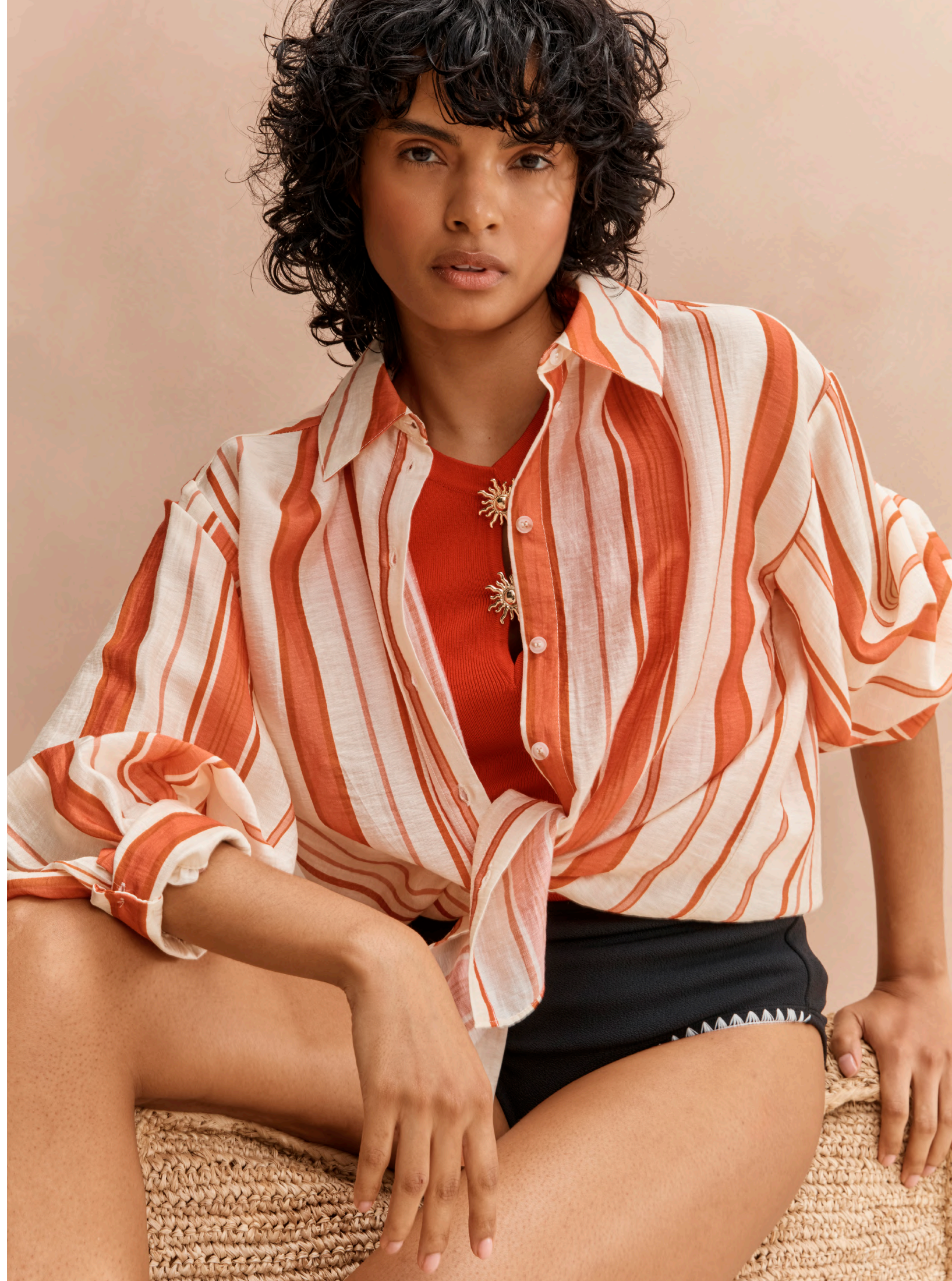
Orange Stripe Relaxed Shirt £18 Berry Red Cut-Out Gold Sun Button Vest £16 Black Blanket Stitch Tankini Full Brief Bottoms £10