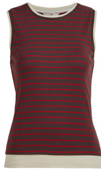
Brown Mock Layer Stripe Vest £8