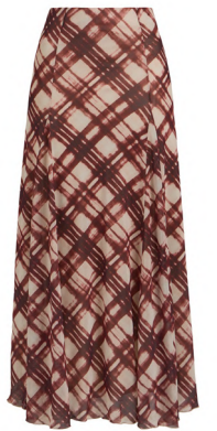
Brown Mesh Check Full Skirt £18