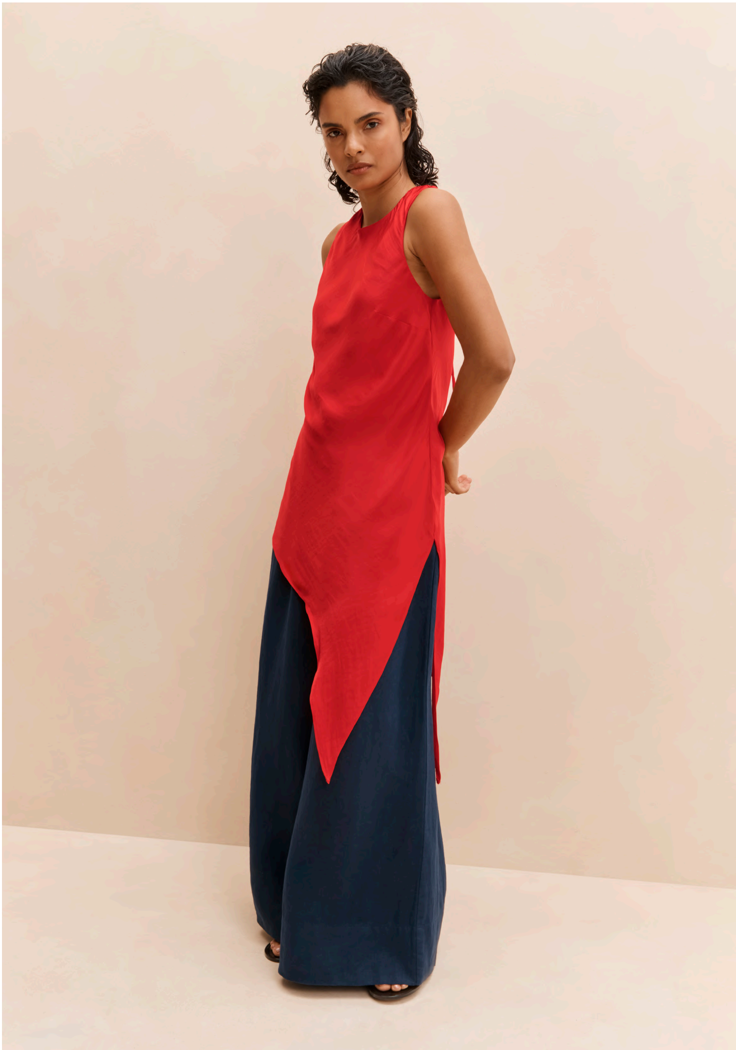
Red Satin Asymmetric Co-ord Top £20 Navy Pure Linen Palazzo Co-ord Trousers £30