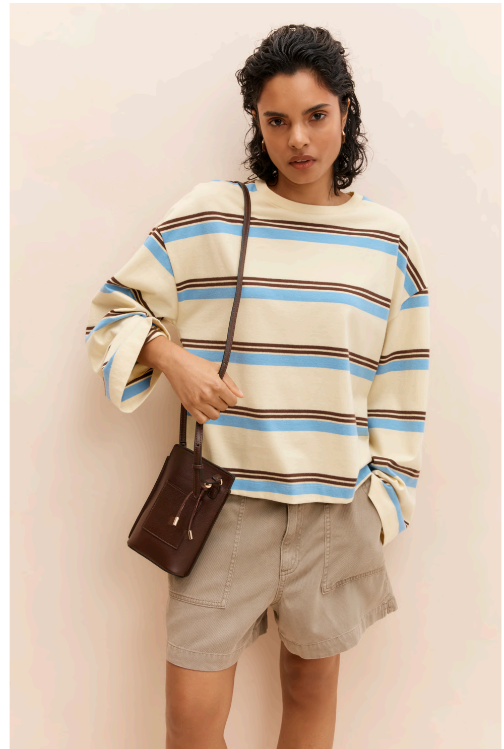
Yellow Stripe Long Sleeve Oversized T-Shirt £14 Brown Stripe Long Sleeve Oversized T-Shirt £14 Brown Phone Bag £10 Khaki Utility Shorts £14