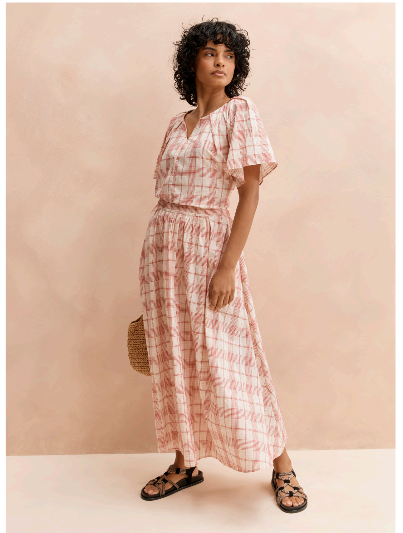
Red Check Tie Waist Co-ord Top £18 Red Check Full Circle Skirt £22.50 Neutral Mini Straw Handheld Shopper Bag £14 Rope Sandal £20