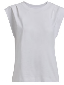
White Slub Short Sleeve Tee £8