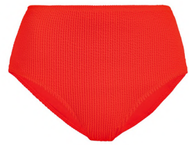
Red Crinkle Full Brief Bikini Bottoms £12