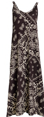
Paisley Print Trapeze Cami Dress £22.50