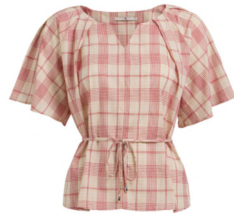
Red Check Tie Waist Co-ord Top £18