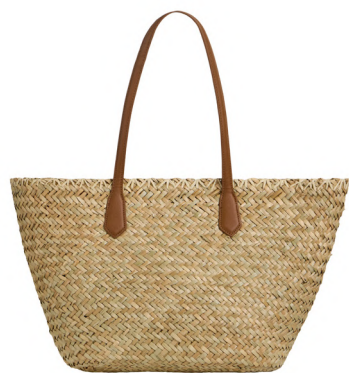
Neutral Large Straw Shopper with Tan Handles £24