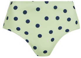
Hybrid Tankini Bottom £10