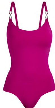
Bright Pink Hammered Gold Trim Swimsuit £18