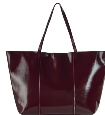
Burgundy High Shine Tote Bag £22