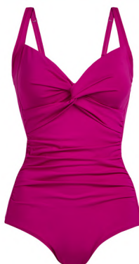
Bright Pink Plain Low-Leg Swimsuit £18