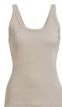
Stone Rio Strappy Vest £6