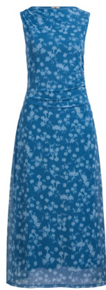
Blue Lace Jersey Blurred Floral Mesh Dress £22.50