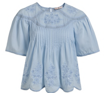
Light Blue Lace Pintuck Short Sleeve Blouse £22.50