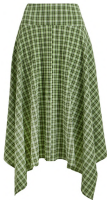
Green Check Hanky Hem Full Skirt £24