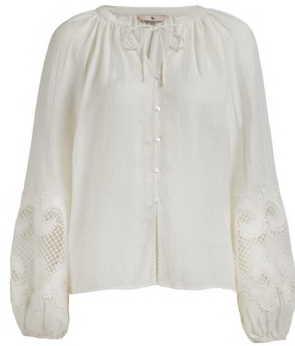
White Lace Embroidered Sleeve Peasant Blouse £24