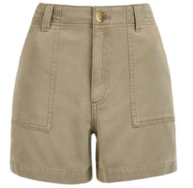
Khaki Utility Shorts £14