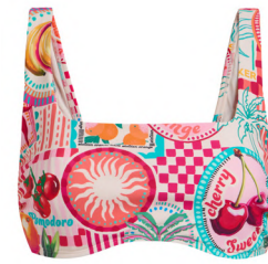
Postcard Print Bikini Top £14