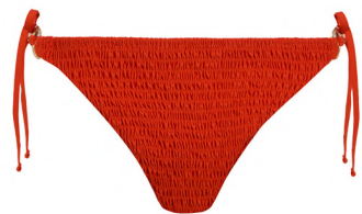
Bright Orange Faux Shirring Tie Side Bikini Bottoms £10