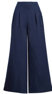
Navy Pure Linen Palazzo Co-ord Trousers £30