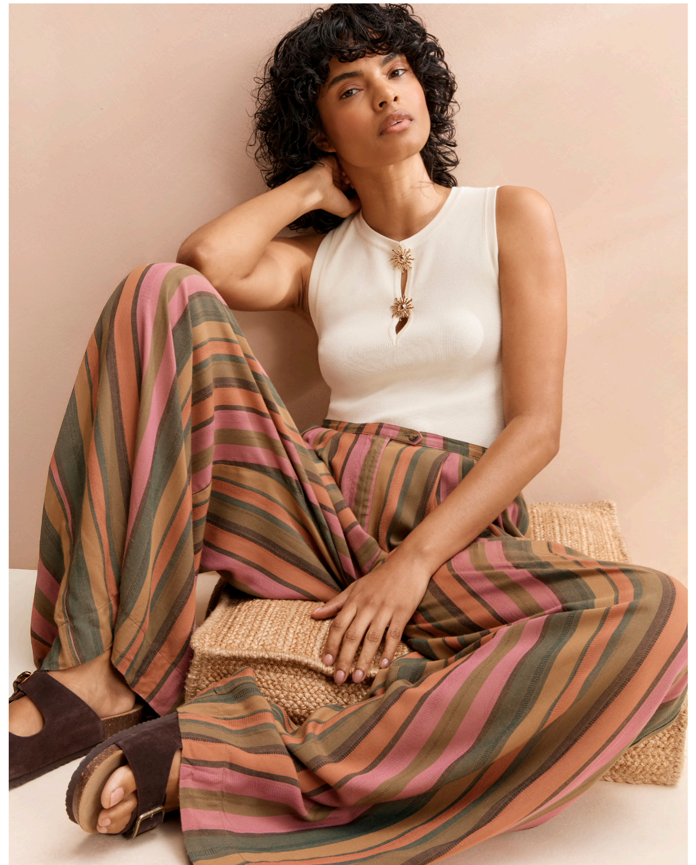
Cream Cut-Out Gold Sun Button Vest £16 Orange and Green Stripe Wide Leg Trousers £18 Neutral Large Straw Shopper with Tan Handles £24 Chocolate Suede Footbed Sandal £20