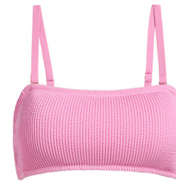
Pink Bandeau Crinkle Bikini Top £14