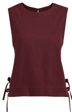
Burgundy Linen Rich Side Tie Shell Co-ord Top £16