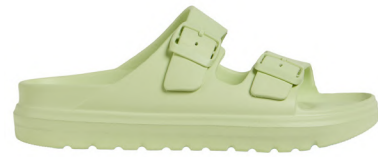
Green EVA Slider £9