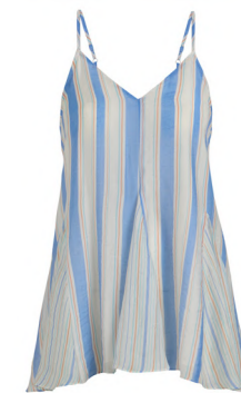
Blue Mixed Stripe Godet Cami £18