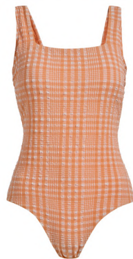
Orange Gingham Swimsuit £12