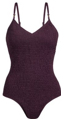
Plum Shirring Swimsuit £20