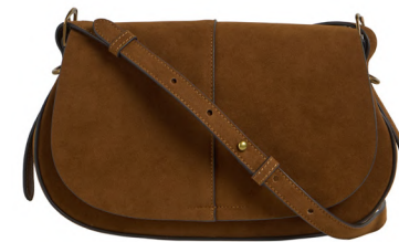
Tan Microfibre Saddle Cross-Body Bag £18