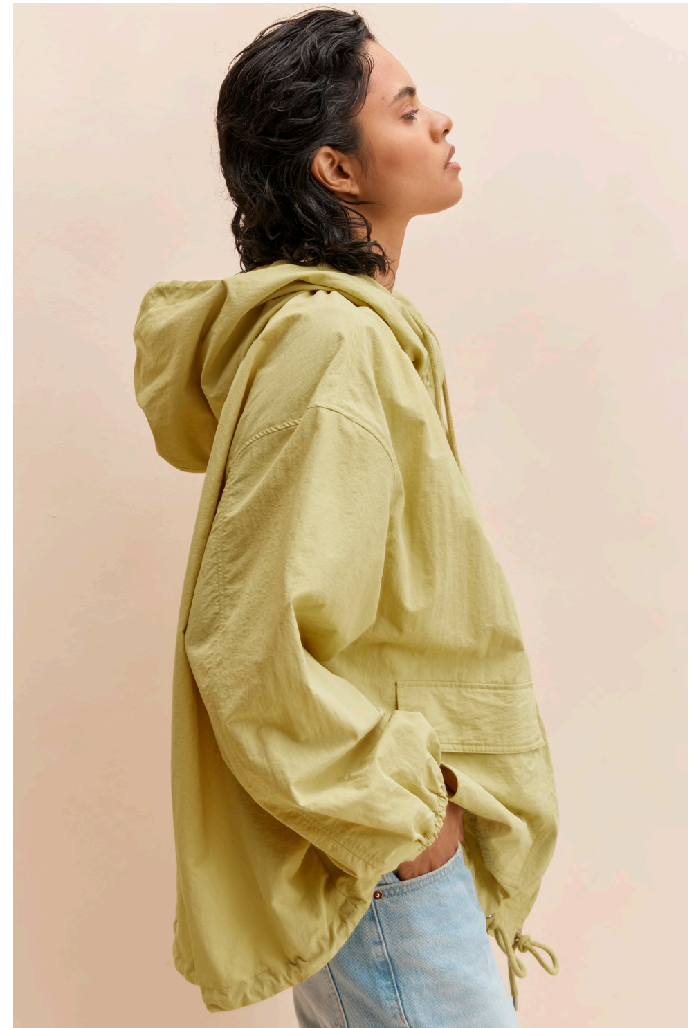
Green Short Windbreaker £34 Bleach Wash Relaxed Straight Ankle Grazer Jeans £22.50