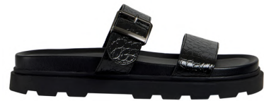
Black Croc Strap Footbed Sandal with Buckle £22