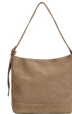
Suede Shoulder Bag £38