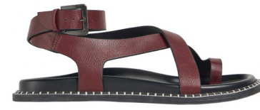
Burgundy Blanket Stitch Footbed Sandal £20