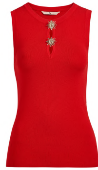
Berry Red Cut-Out Gold Sun Button Vest £16