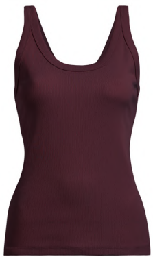
Dark Red Rio Strappy Vest £6