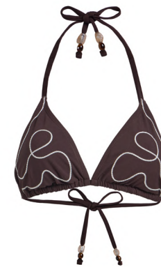
Brown Embroidered Triangle Bikini Top £14