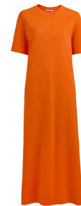
Orange Jersey Maxi T-Shirt Dress £18