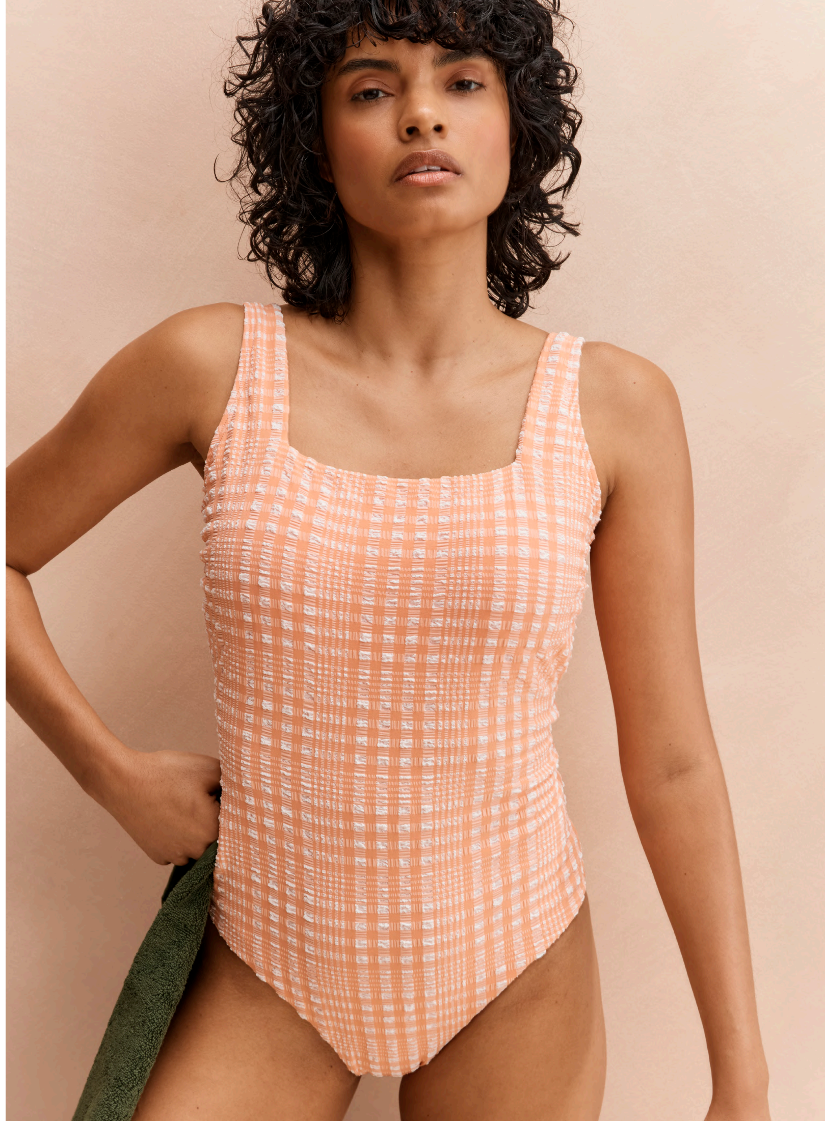
Orange Gingham Swimsuit £12