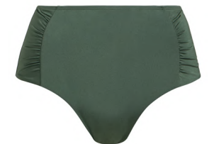
Khaki Ruched Side Full Brief Bottoms £12