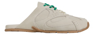
Neutral Suede Panelled Trainer Mule £26