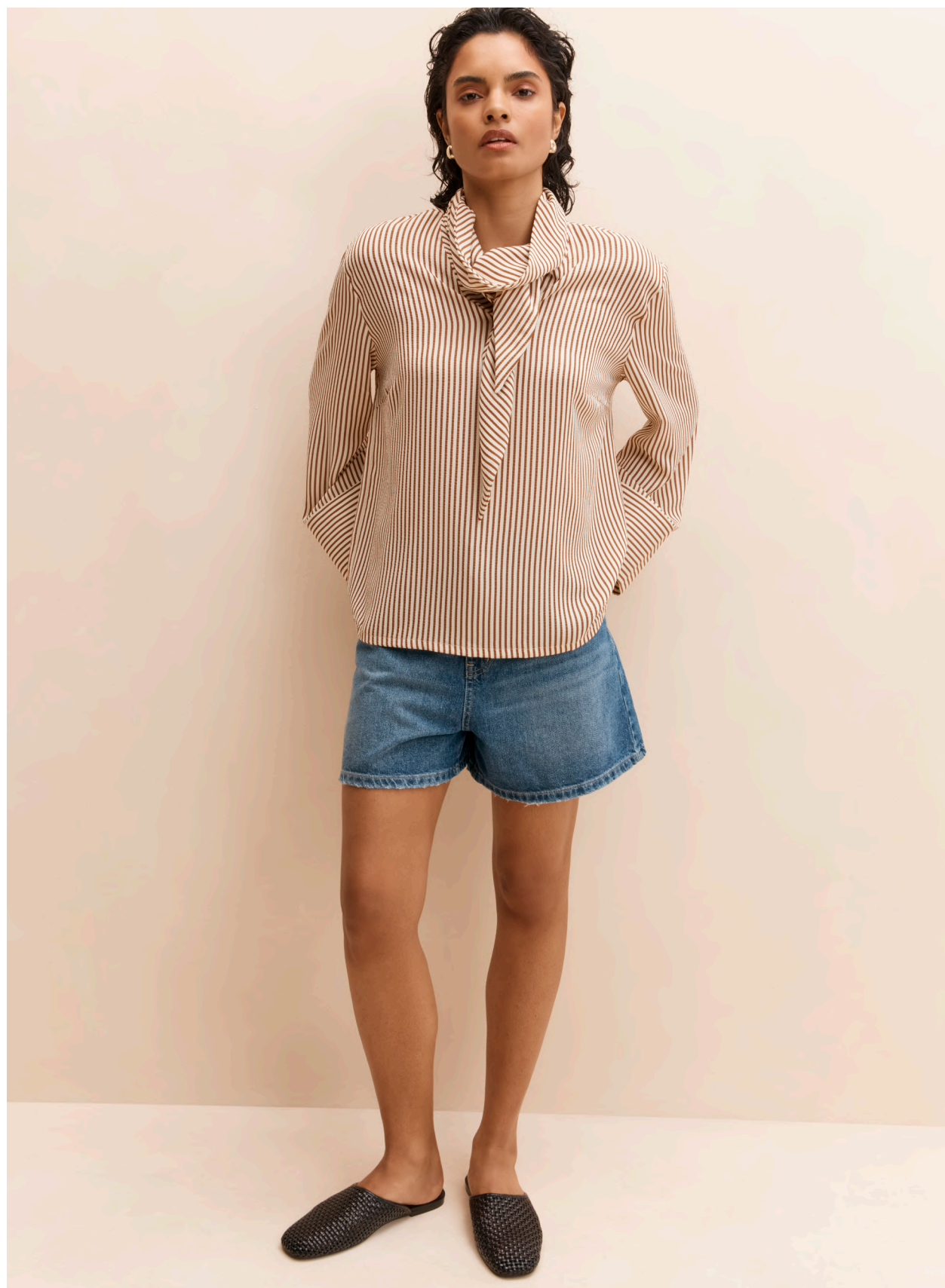
Neutral Stripe Long Sleeve Scarf Blouse £20 Greencast Dark Denim A-Line Belted Boy Shorts £18 Black Woven Mule £20