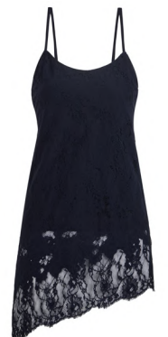
Navy Lace Jersey Cami Top Co-ord £20