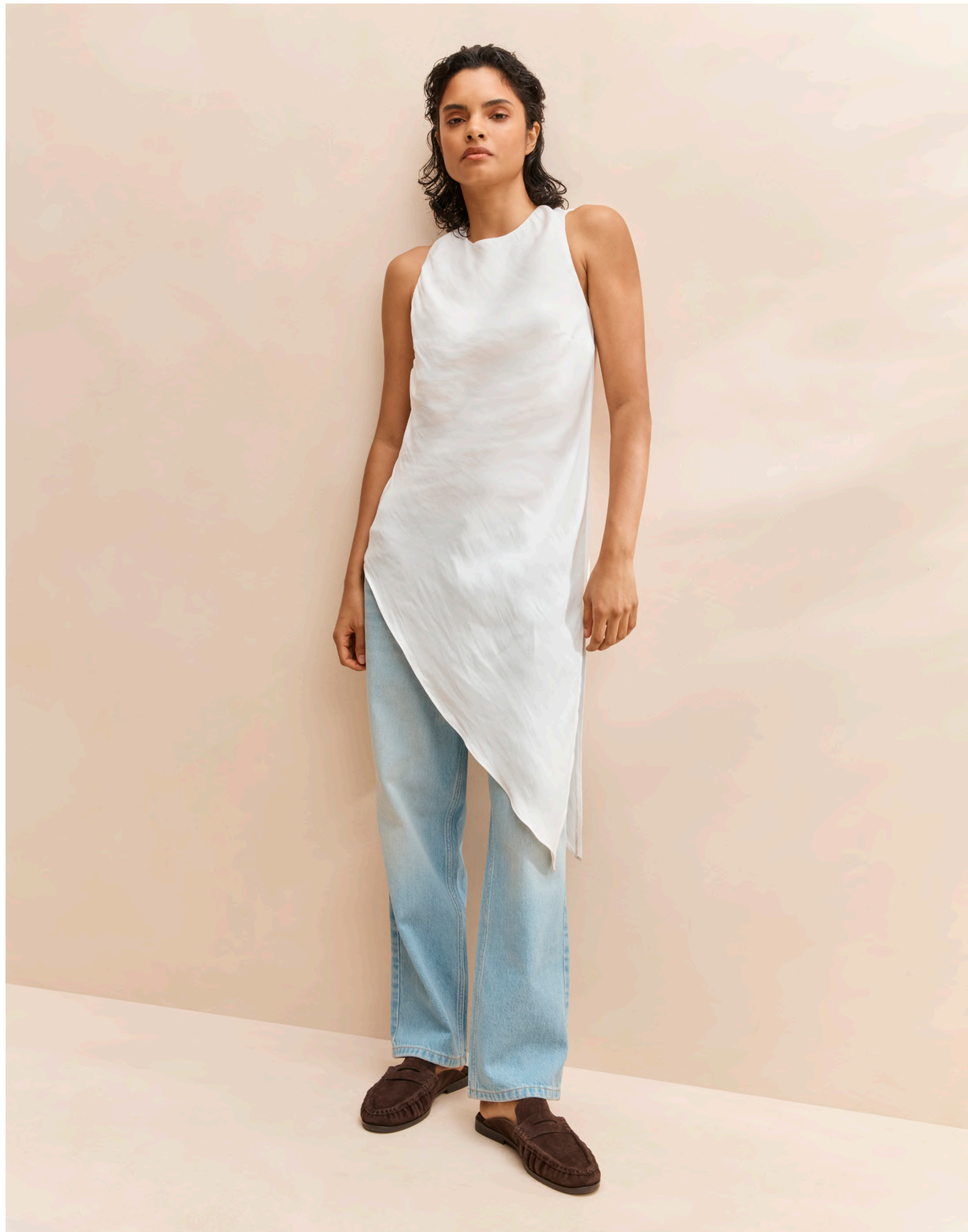
White Satin Asymmetric Co-ord Top £20 Bleach Wash Relaxed Straight Ankle Grazer Jeans £22.50 Brown Suede Mule Loafer £30