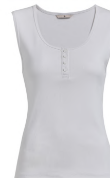
White Button Placket Rib Vest £7