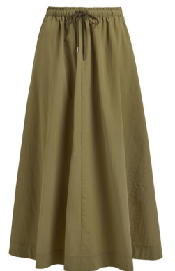
Soft Light Khaki Techno Full Skirt Co-ord £24