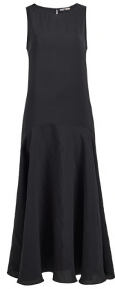
Black Sandwash Midi Dress £30