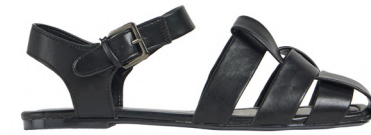
Black PU Fisherman Sandal £24