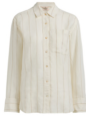
Neutral Stripe Pure Linen Shirt £26