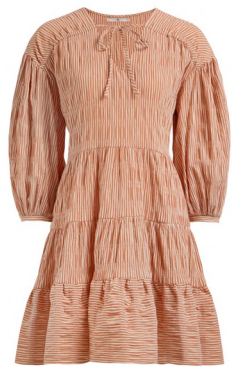
Red Stripe Short Sleeve Mini Dress £24