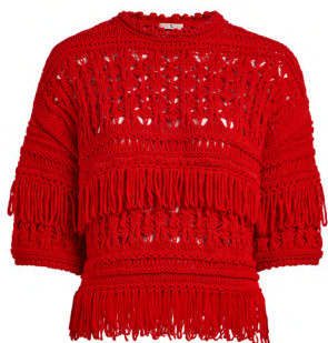
Red Fringed Open Stitch Jumper £26