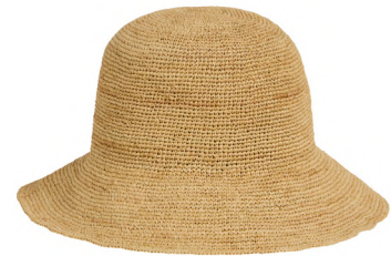
Neutral Raffia Bucket Hat £16