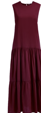
Berry Red Drop Waist Tiered Voile Dress £26