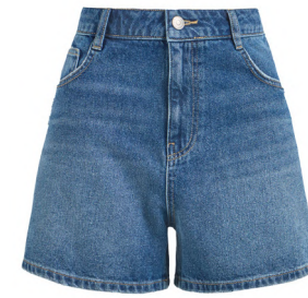
Greencast Dark Denim A-Line Belted Boy Shorts £18