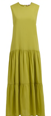
Lime Green Drop Waist Tiered Voile Dress £26