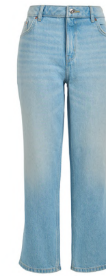
Light Denim Bleach Wash Relaxed Straight Ankle Grazer Jeans £22.50