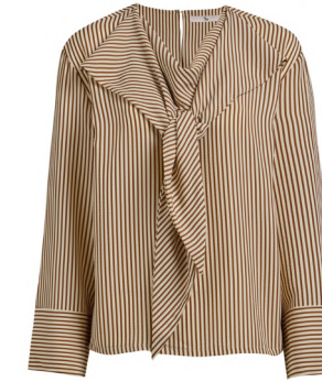
Neutral Stripe Long Sleeve Scarf Blouse £20