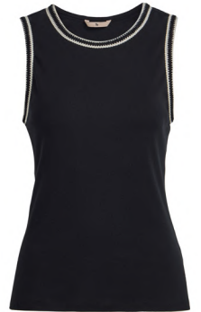
Black Crochet Trim Vest £10