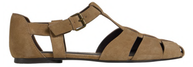
Neutral Suede Fisherman Sandal £24