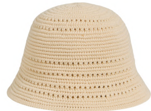
Neutral Crochet Bucket Hat £14