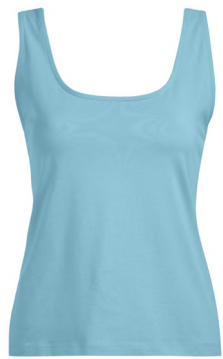
Blue Square Neck Plain Vest £5