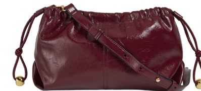
Burgundy Crinkle Drawstring Gathered Cross-Body Bag £20