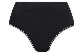
Black Blanket Stitch Tankini Full Brief Bottoms £10