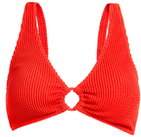
Red Ring Detail Crinkle Bikini Top £14