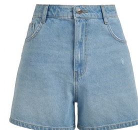
Light Denim A-Line Boy Shorts £14