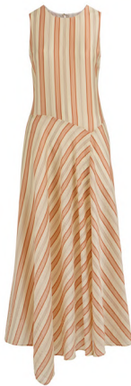
Orange Stripe Racer Dress £28