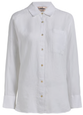
White Pure Linen Shirt £26