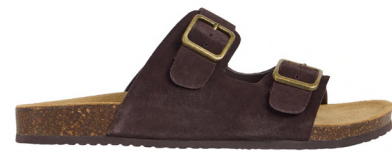
Chocolate Suede Footbed Sandal £20