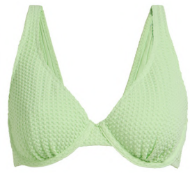
Lime Bubble Texture Wired Bikini Top £16