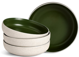
Raw Edge 4 Piece Stoneware Pasta Bowls 4pk, £15