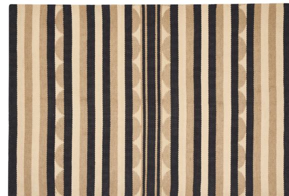
Flatweave Scalloped Stripe Rug 120x170, £65