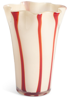
Milk Glass Handkerchief Stripe Vase, £20