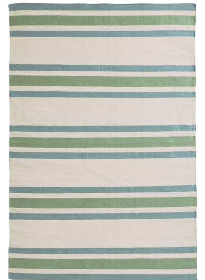
Flatweave Stripe Rug 120x170, £65