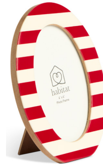
Striped Oval Frame, £7