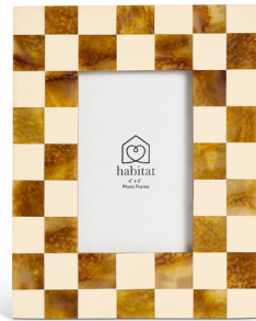
Checkerboard Frame 4x6, £14