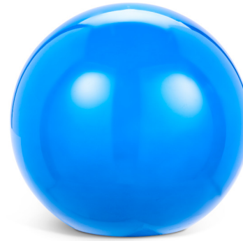
Caliban Globe Glass Table Lamp, £20