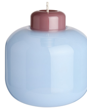
Block Colour Easy Fit Shade, £25