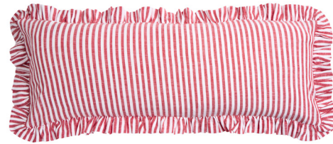
Long Stripe Ruffle Cushion 80x30, £18