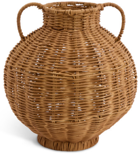
Rattan Vase with Handles, £20