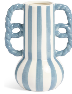
Stripe Vase with Wavy Handles, £10