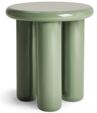
Totley Side Table, £80