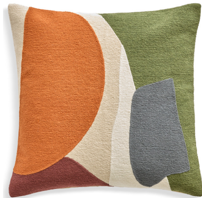
Autumn Abstract Crewel Cushion 43x43, £16