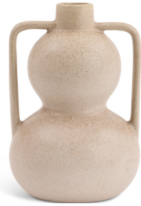
Gourd Ceramic Vase, £15