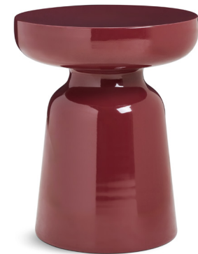
Cohen Side Table, £50