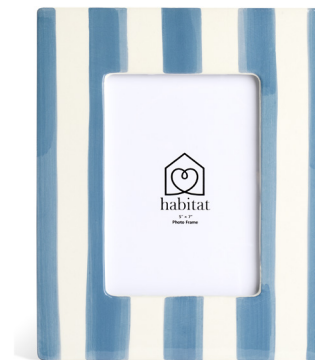
Ceramic Stripe Photo Frame, 5x7, £10