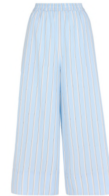
Blue Stripe Cotton Poplin Palazzo £20