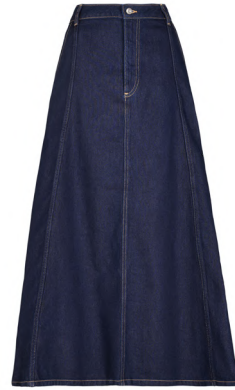
Dark Denim Co-ord Full A-Line Skirt £22.50