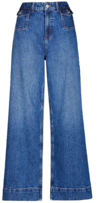
Light Denim Patch Pocket Flares £25