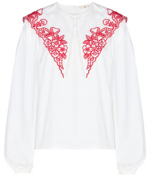
White Poplin Embroidered Collar Blouse £22.50