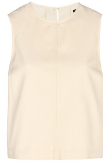
Buttermilk Denim Co-ord Shell Top £16