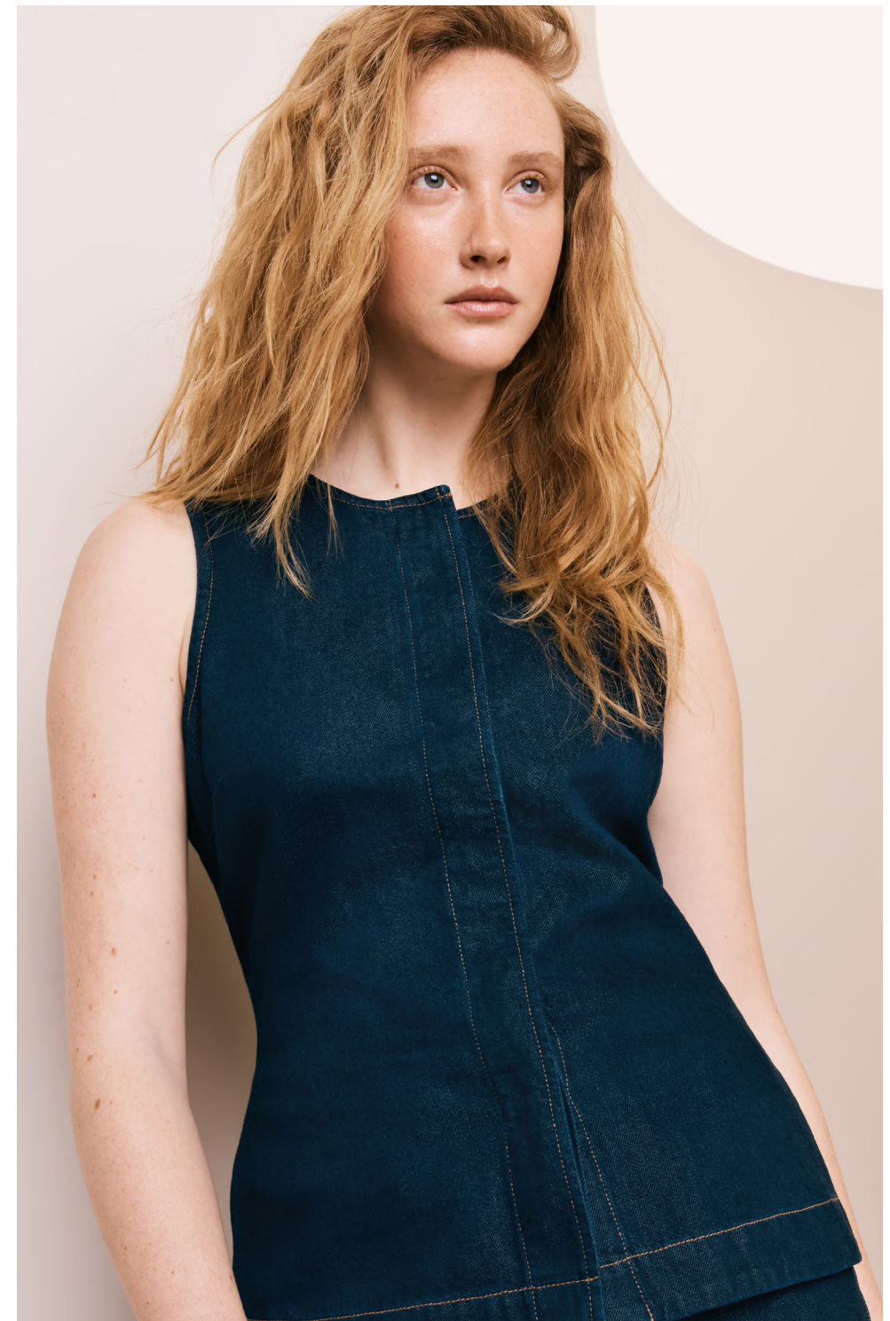
Dark Denim Longline Co-ord Waistcoat £19.50 Dark Denim Patch Pocket Flares £25 Bone Peep-Toe Mules £18