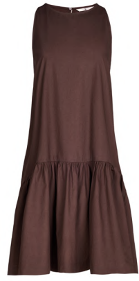
Brown Drop Waist Mini Dress £20