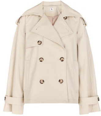
Stone Short Trench £36