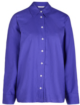
Blue Linen-Rich Relaxed Shirt £20