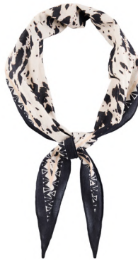
Skinny Cow Print Scarf £8