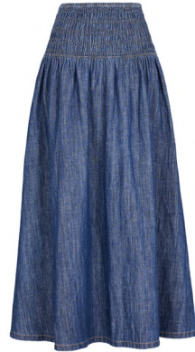
Dark Denim Linen Blend Shirred Full Skirt £22.50