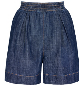
Dark Denim Linen Blend Pull-On Co-ord Shorts £14