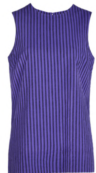
Blue Stripe Co-ord Tunic £18