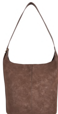
Chocolate Faux Suede Bucket Bag £18