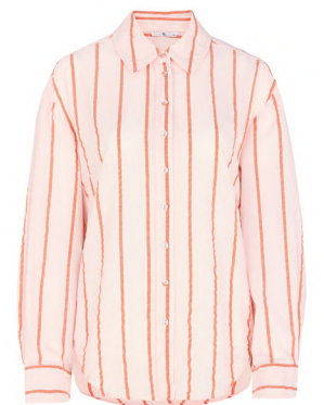
Coral Stripe Shirt £18