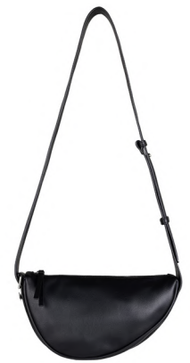
Black PU Half Moon Crossbody Bag £16