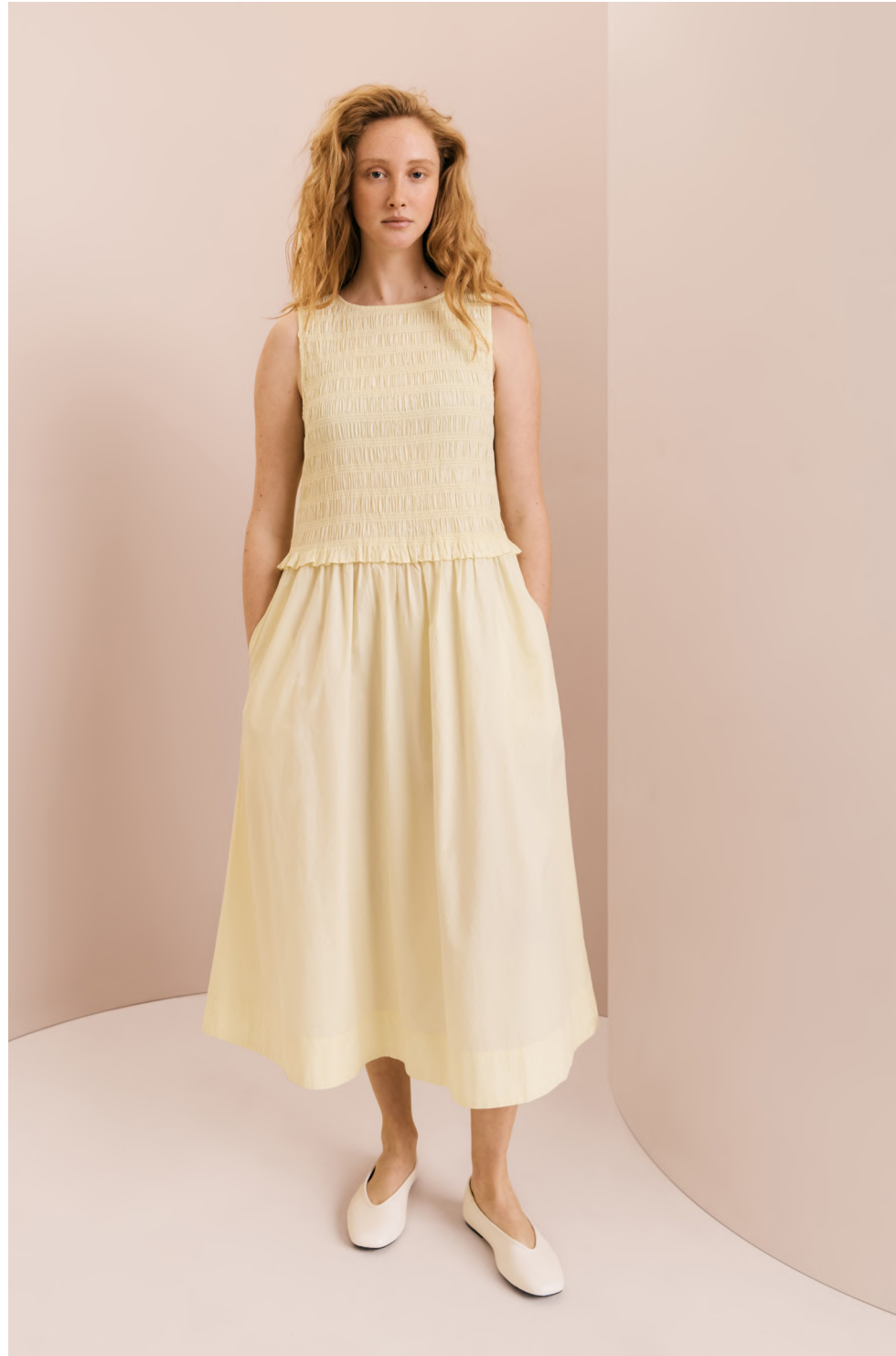
Yellow Poplin Shirred Sleeveless Dress £26 Bone Core Ballerina £14