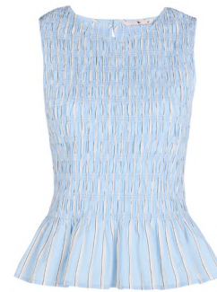
Blue Stripe Shirred Co-ord Top £18