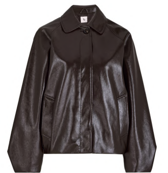
Brown Gloss PU Bubble Hem Jacket £40