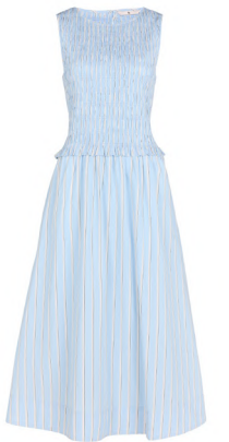
Blue Stripe Poplin Shirred Sleeveless Dress £26