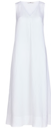
White Pure Linen V-Neck Dress £38