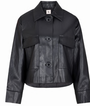
Black PU Jacket £36