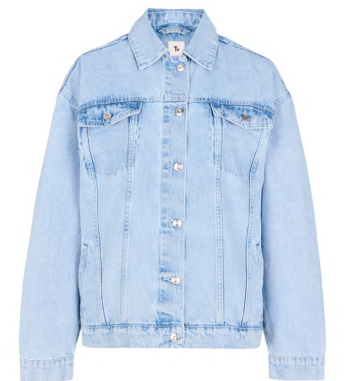
Bleach Wash Oversized Trucker Jacket £28