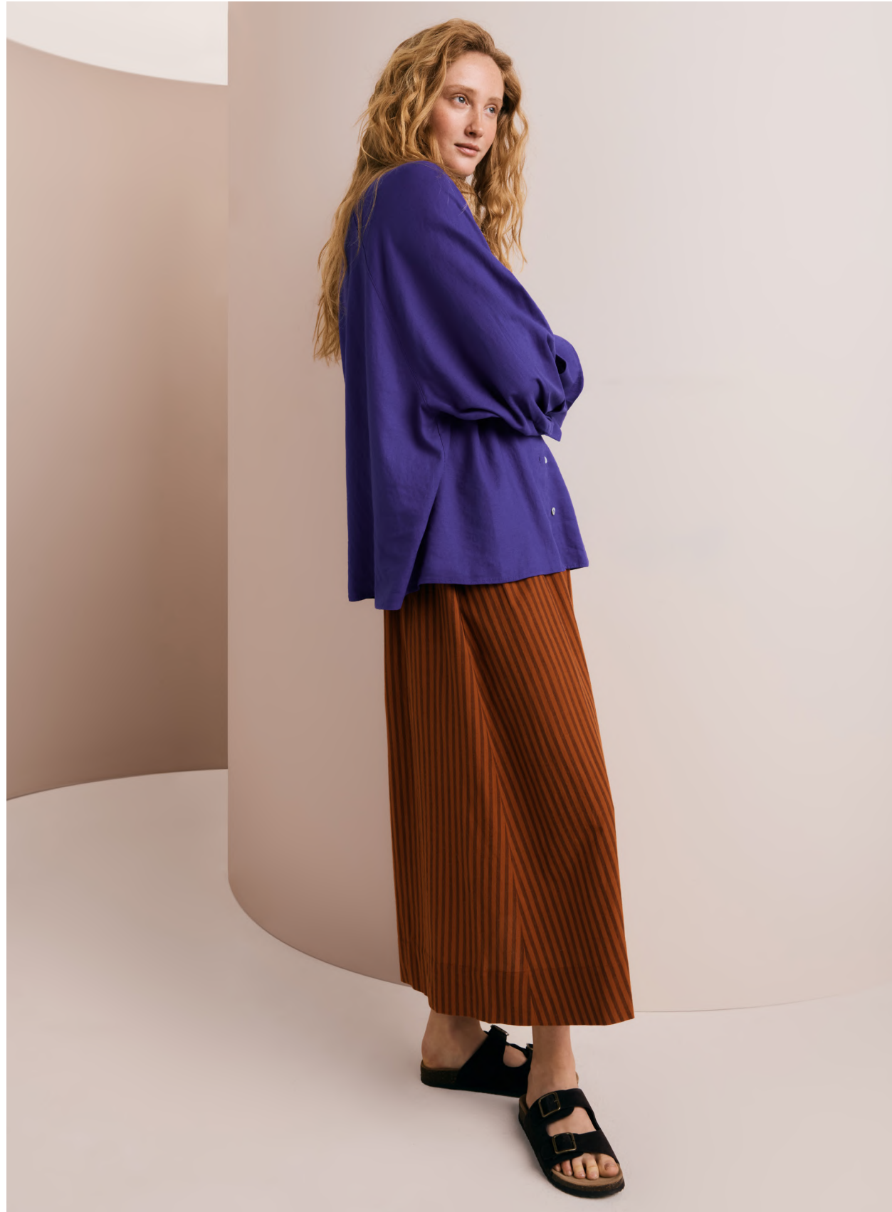
Blue Linen-Rich Relaxed Shirt £20 Brown Stripe Co-ord Skirt £22.50 Chocolate Suede Footbed Sandal £20