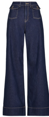
Dark Denim Patch Pocket Flares £25