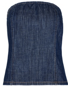
Dark Denim Linen Blend Co-ord Bandeau £16