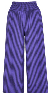
Blue Stripe Crop Co-ord Palazzo £18