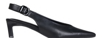
Black Slingback Kitten Heel £20