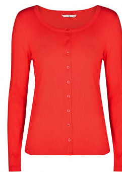
Red Ribbed Button-Through Top £10