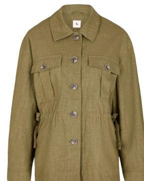
Khaki Utility Jacket with Linen £36