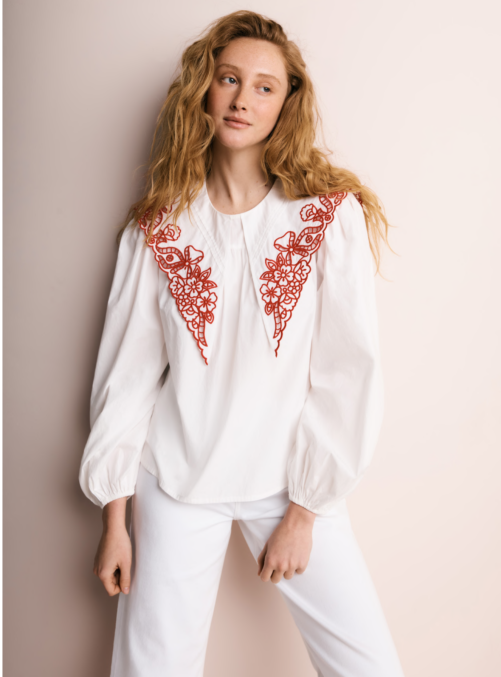
White Poplin Embroidered Collar Blouse £22.50 White Patch Pocket Flares £25