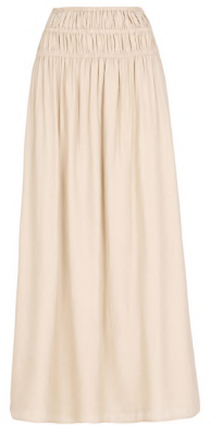
Stone Crinkle Co-ord Tiered Skirt £24