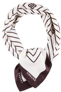
Satin Square Mono Linear Print Scarf £8