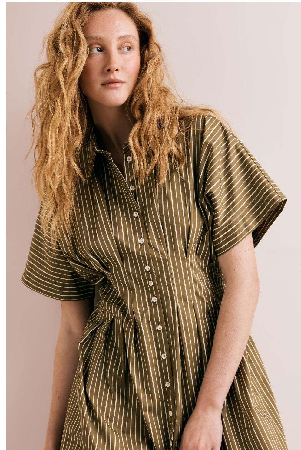
Khaki Stripe Poplin Cinched Waist Shirt Dress £30 Brown Toe-Detail Footbed Sandal £20