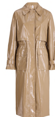
Neutral High-Shine Longline Mac £60