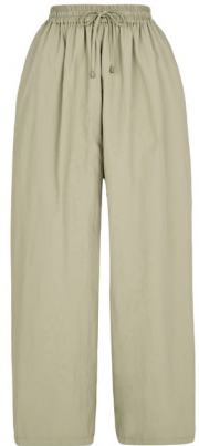
Soft Khaki Botanical Co-ord Trouser £20