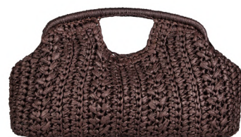
Chocolate Straw Woven Clutch £18