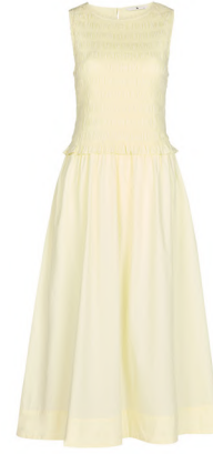
Yellow Poplin Shirred Sleeveless Dress £26