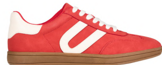
Red Low Profile Trainer £18