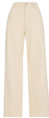
Buttermilk Wide Leg Jeans £22.50