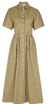
Khaki Stripe Poplin Cinched Waist Shirt Dress £30