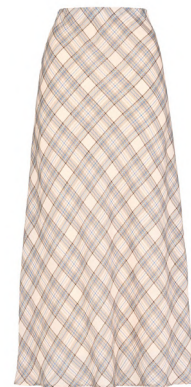
Check Skirt £24