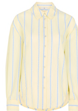
Yellow Stripe Shirt £18