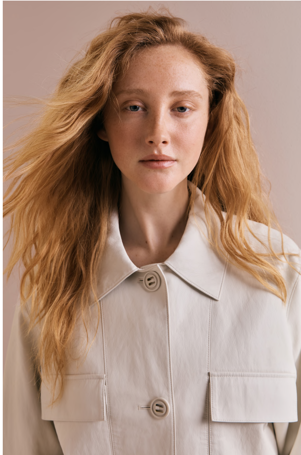
Stone PU Jacket £36 Dark Denim Patch Pocket Flares £25