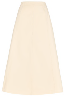
Buttermilk Denim Panelled Co-ord Full Skirt £22.50