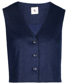
Navy Pure Linen Co-ord Waistcoat £30