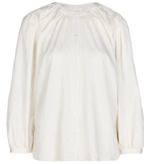
Cream Stripe Blouse £20