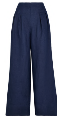
Navy Pure Linen Palazzo Co-ord Trousers £30