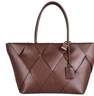
Dark Chocolate Woven Shopper Bag £22