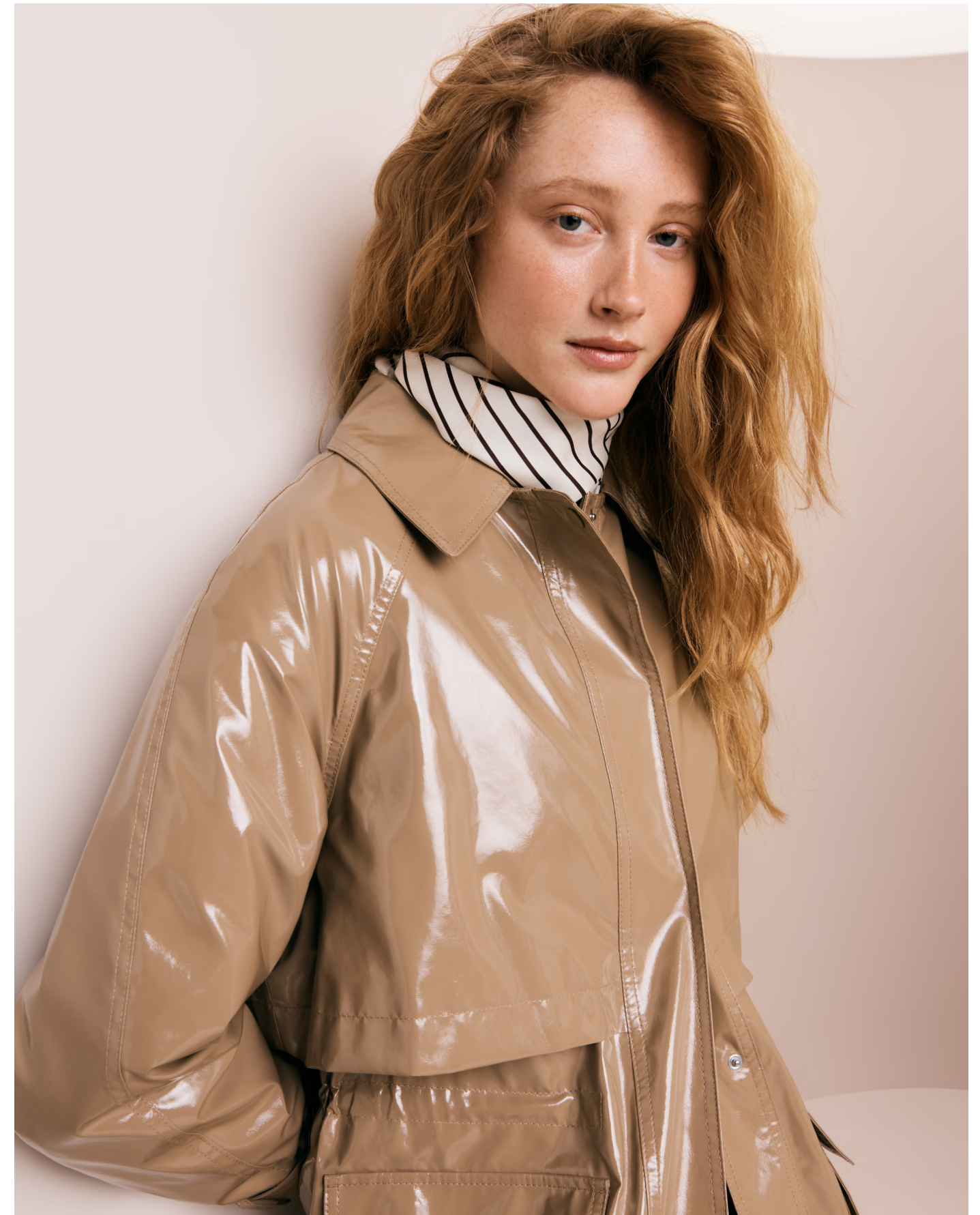
Neutral High-Shine Longline Mac £60 Satin Square Mono Linear Print Scarf £8 Navy Cotton Poplin Palazzo Trouser £20 Black Strap Ballerina £15