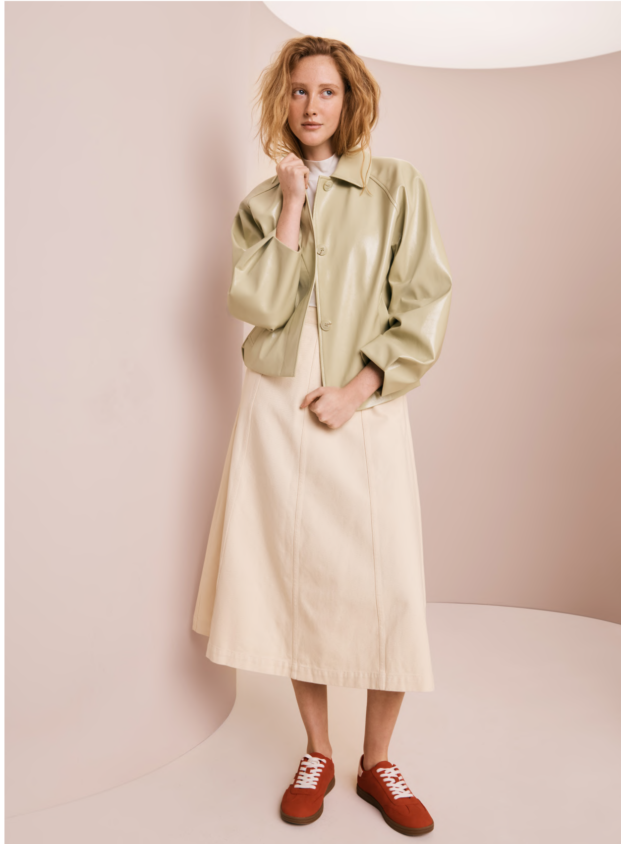
Green Gloss PU Bubble Hem Jacket £40 Buttermilk Denim Panelled Co-ord Full Skirt £22.50 Red Low Profile Trainer £18