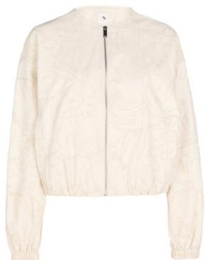
Cream Cornelli Embroidered Jacket £34