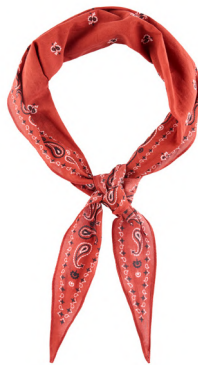
Skinny Red Paisley Scarf £8