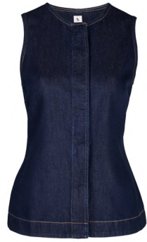
Dark Denim Longline Co-ord Waistcoat £19.50