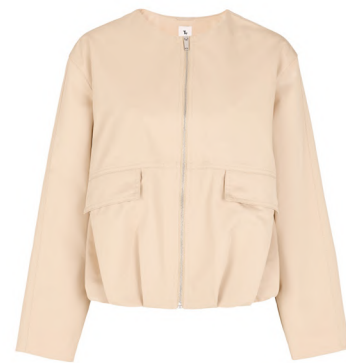
Neutral Bubble Hem Zip Jacket £30