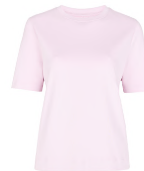
Pink Ultimate Short Sleeve Plain Tee £8