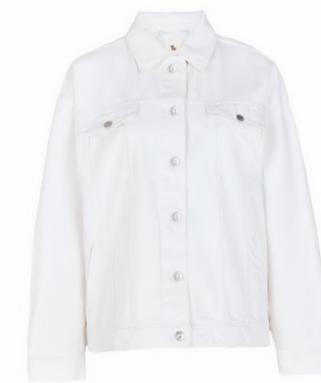
White Oversized Trucker Jacket £28