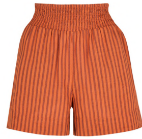
Rust Stripe Shell Co-ord Shorts £14