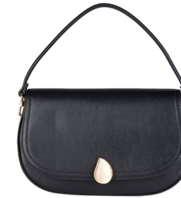
Black Crossbody Satchel £18