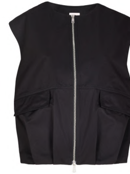
Black Collarless Zip Gilet £26