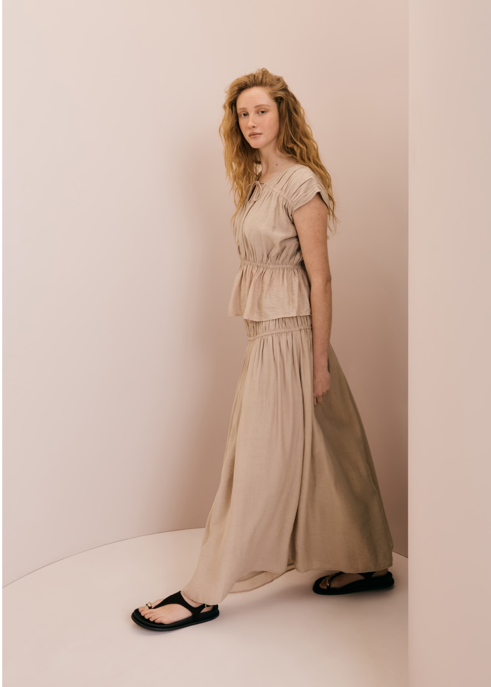
Brown Toe-Detail Footbed Sandal £20