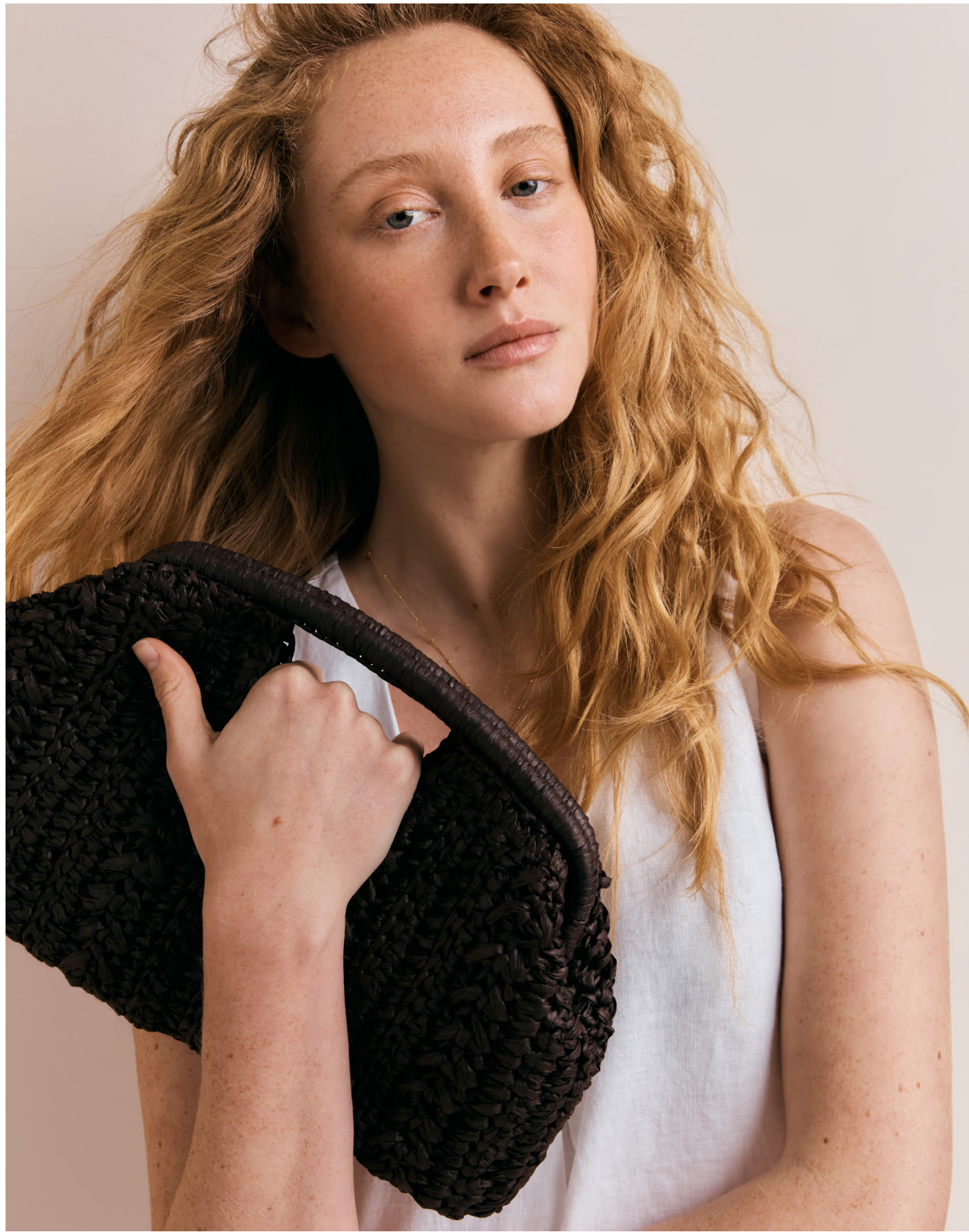
White Pure Linen V-Neck Dress £38 White Pure Linen Palazzo Co-ord Trouser £30 Chocolate Straw Woven Clutch £18 Brown Toe-Detail Footbed Sandal £20