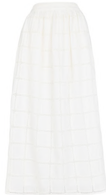
White Check Broderie Co-ord Full Skirt £30