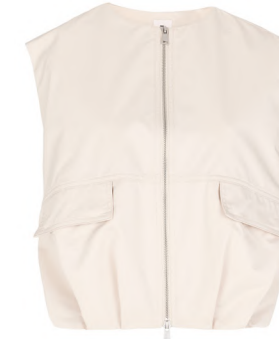
Stone Collarless Zip Gilet £26