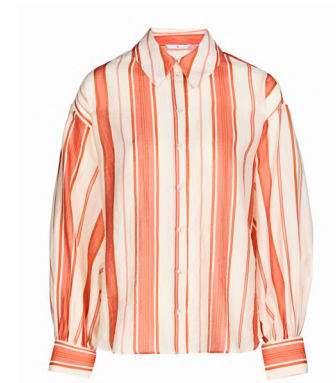
Orange Stripe Relaxed Shirt £18