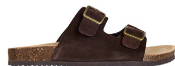
Chocolate Suede Footbed Sandal £20