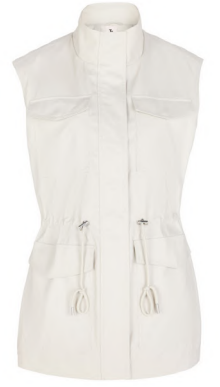
Cream Utility Gilet £36