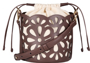
Chocolate Cutwork Bucket Bag £18