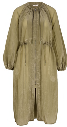
Khaki Shimmer Tech Raincoat £36