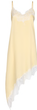
Buttermilk Sandwash Lace Trim Cami £30