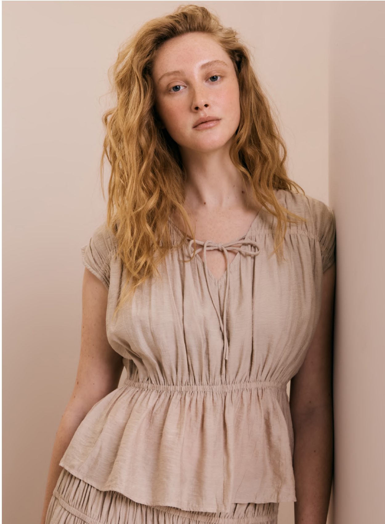
Stone Crinkle Co-ord Tie-Front Top £18