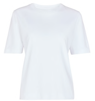
White Ultimate Short Sleeve Plain Tee £8