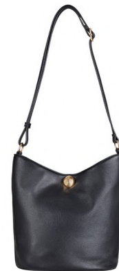
Black Bucket Bag £18