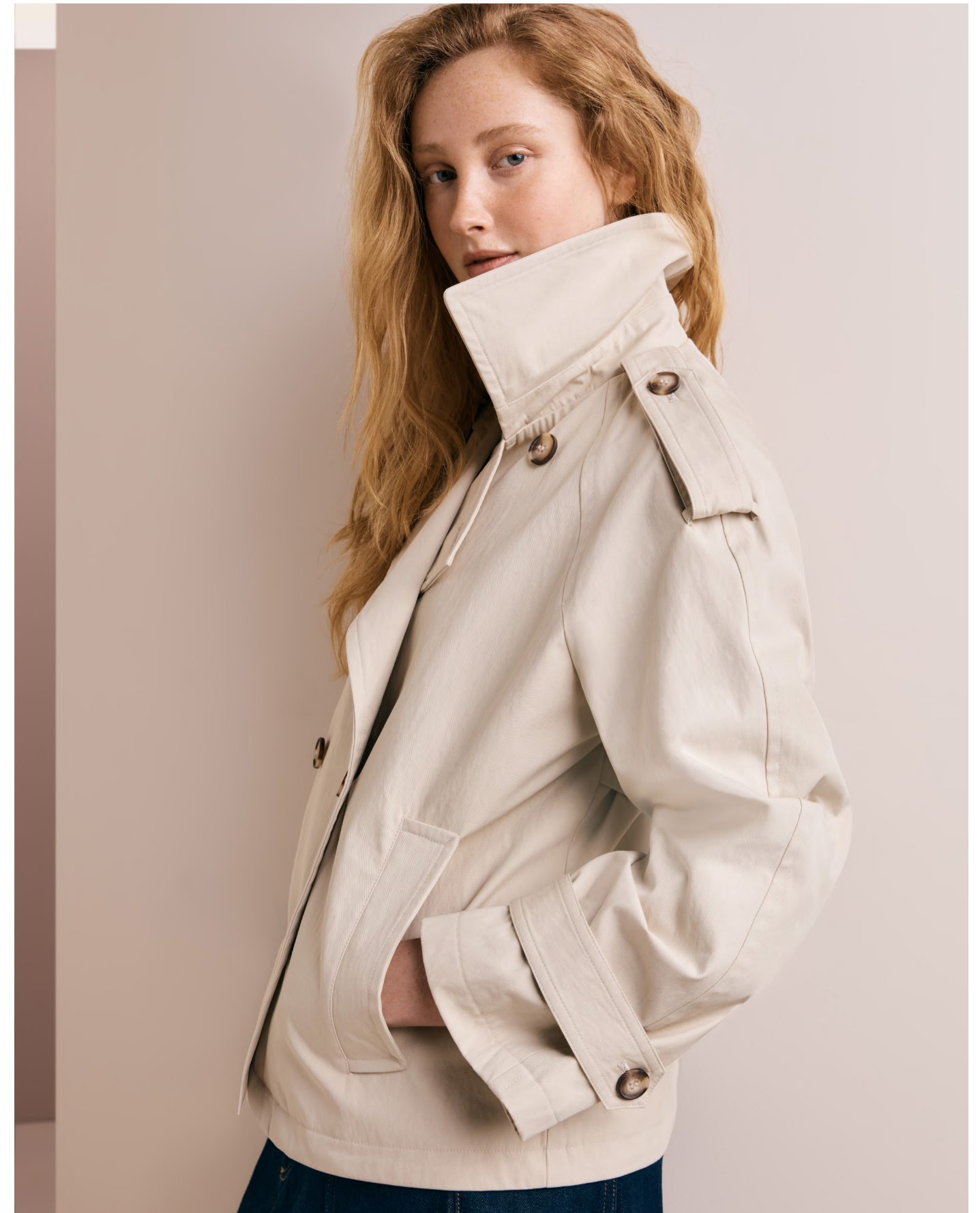
Stone Short Trench £36 Dark Denim Co-ord Full A-Line Skirt £22.50 Red Low Profile Trainer £18