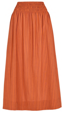
Brown Stripe Co-ord Skirt £22.50