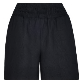
Black Linen-Rich Casual Short £14