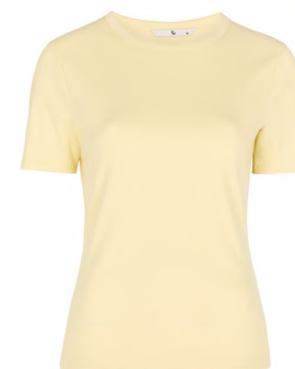
Yellow Slim Fit Tee £7