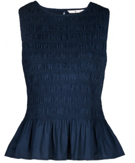
Navy Shirred Poplin Co-ord Top £18