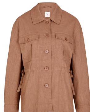
Brown Utility Jacket with Linen £36