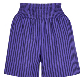
Blue Stripe Co-ord Short £14