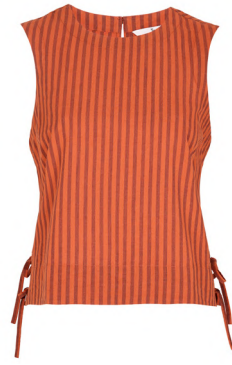
Rust Stripe Shell Co-ord Top £16