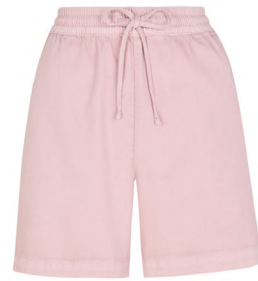
Soft Pink Denim Pull-On Co-ord Shorts £14