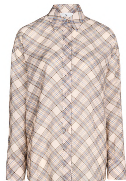
Relaxed Check Sheer Shirt £20