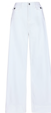
White Patch Pocket Flares £25