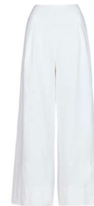
White Pure Linen Palazzo Co-ord Trouser £30