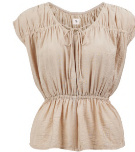
Stone Crinkle Co-ord Tie-Front Top £18