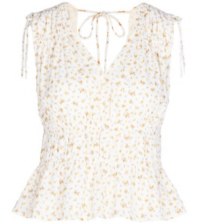
Shirred Seersucker Ditsy Floral Co-ord Top £20