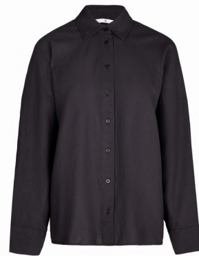
Black Linen-Rich Relaxed Shirt £20