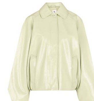
Green Gloss PU Bubble Hem Jacket £40