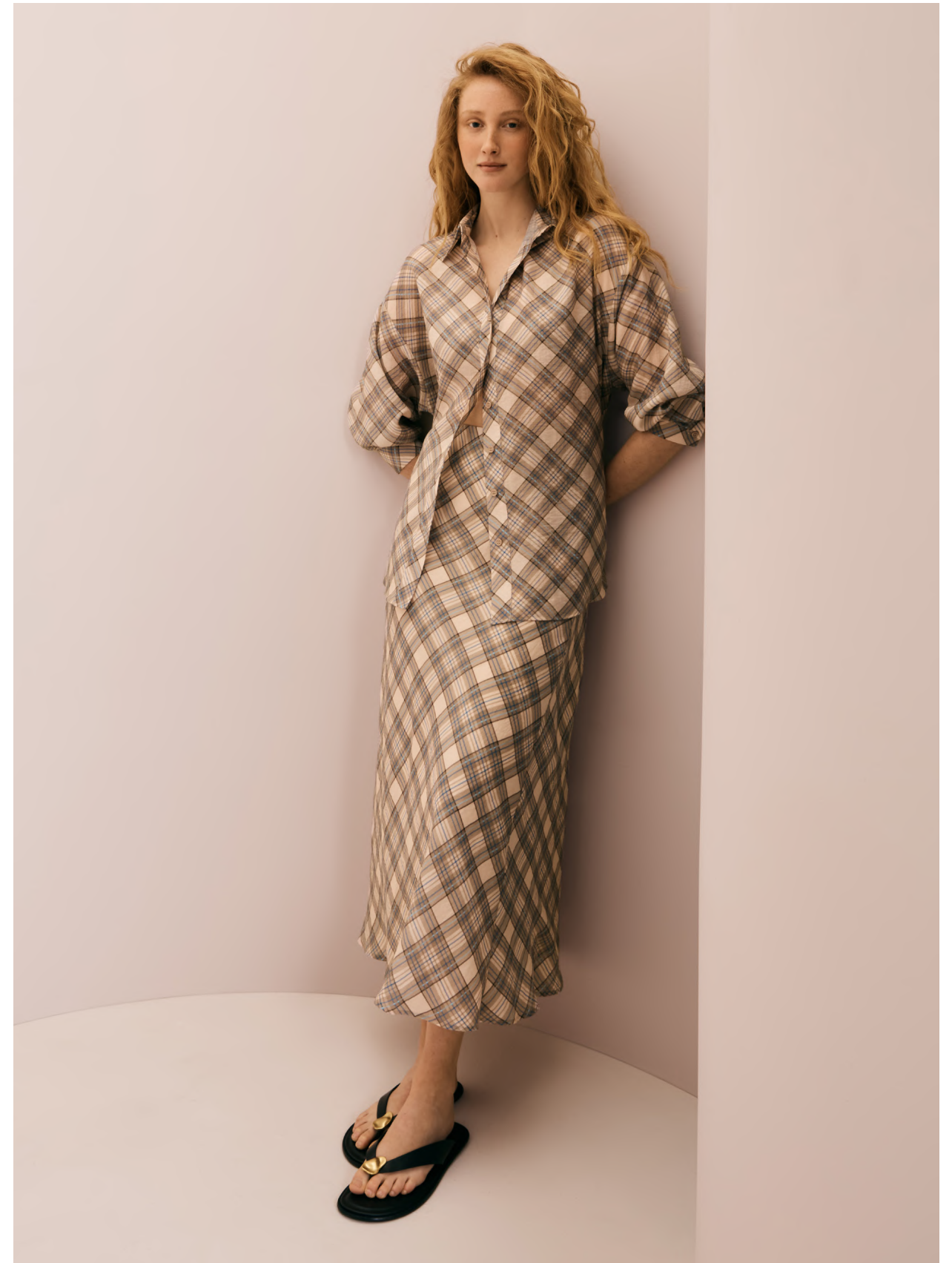
Relaxed Check Sheer Shirt £20 Check Skirt £24 Black Leather Toe Post Sandal £20