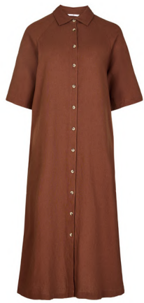
Brown Linen-Rich Shirt Dress £32