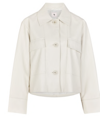
Stone PU Jacket £36