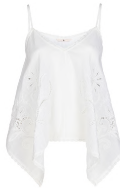
White Lace Cutwork Cami Top £22.50