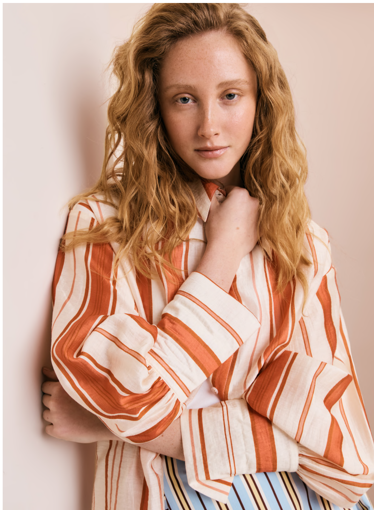
Orange Stripe Relaxed Shirt £18 Blue and Yellow Stripe Poplin Co-ord Full Skirt £24 Black Jelly Mule £10