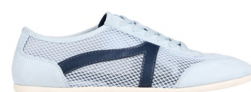
Blue Low Profile Mesh Trainer £18