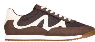
Brown Low Profile Court Trainer £20

Available at tu.co.uk , argos.co.uk and in selected Sainsbury's stores