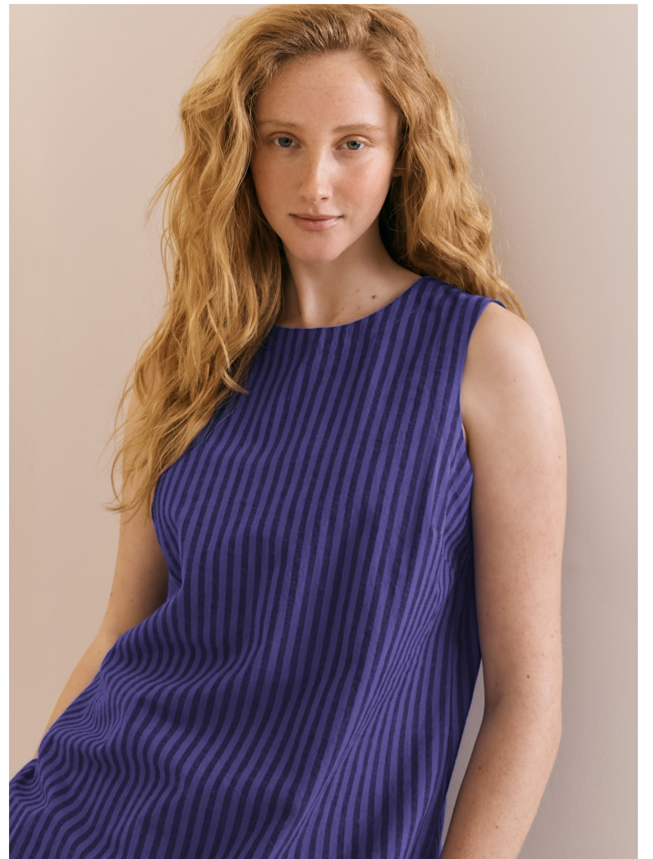
Blue Stripe Co-ord Tunic £18 Blue Stripe Co-ord Short £14 Chocolate Suede Footbed Sandal £20