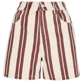
Rust Stripe Denim Co-ord Short £18