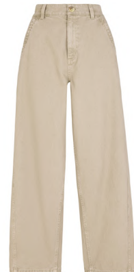
Tan Twisted Seam Barrel Trousers £22.50