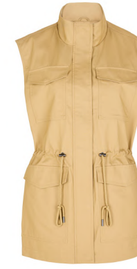
Tan Utility Gilet £36