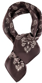
Chocolate Satin Square Paisley Print Scarf £8