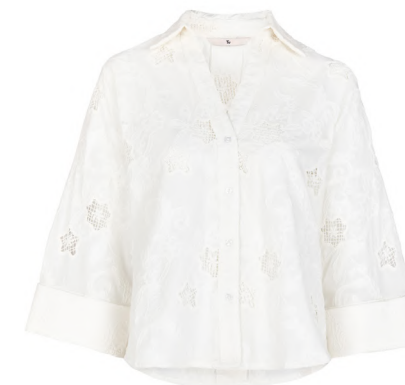
White Lace Embroidered Sleeve Peasant Blouse £24