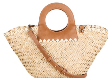
Neutral Mini Straw Bag with Round Handle £20