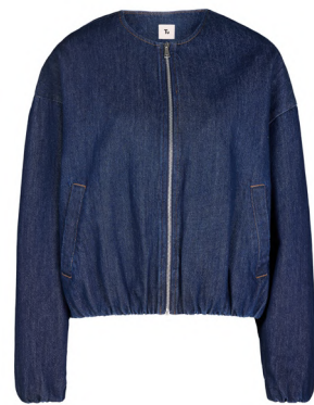
Dark Denim Bomber Jacket £28