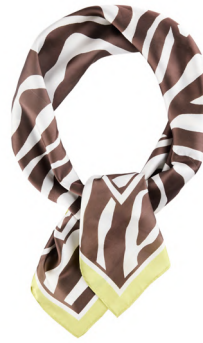
Large Satin Square Zebra Print Scarf £10