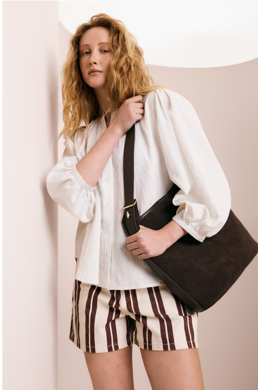
Cream Stripe Blouse £20 Rust Stripe Denim Co-ord Short £18 Chocolate Faux Suede Bucket Bag £18