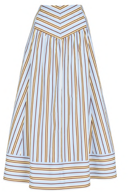
Blue and Yellow Stripe Poplin Co-ord Full Skirt £24