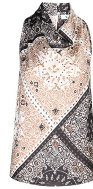
Mono Scarf Print Cowl Neck Top £16